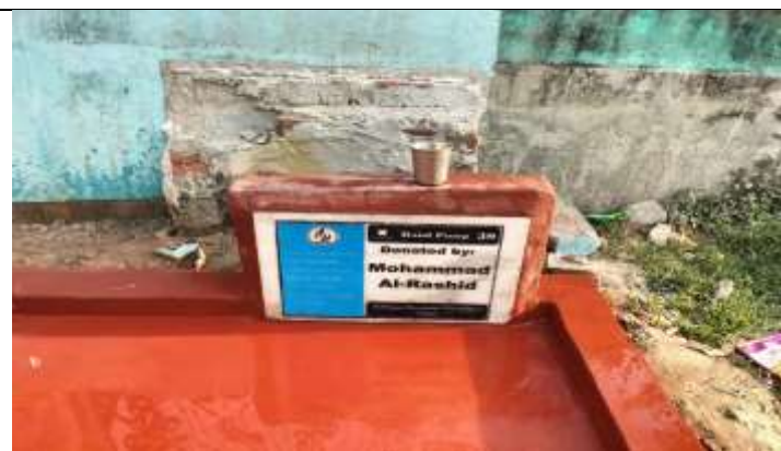
Hand Pump ( Well No:039