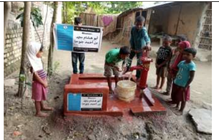
Hand Pump ( Well No:005)