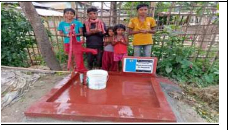
Hand Pump ( Well No:033