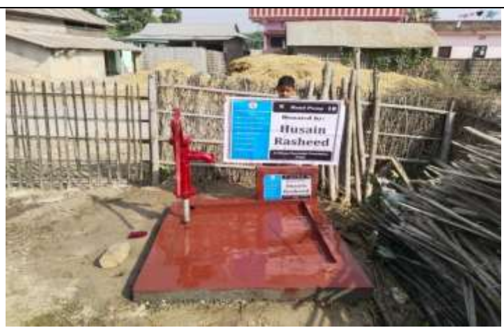
Hand Pump ( Well No:018)