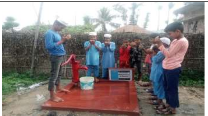
Hand Pump ( Well No:045