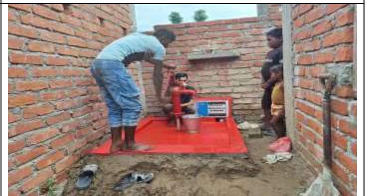
Hand Pump ( Well No:051