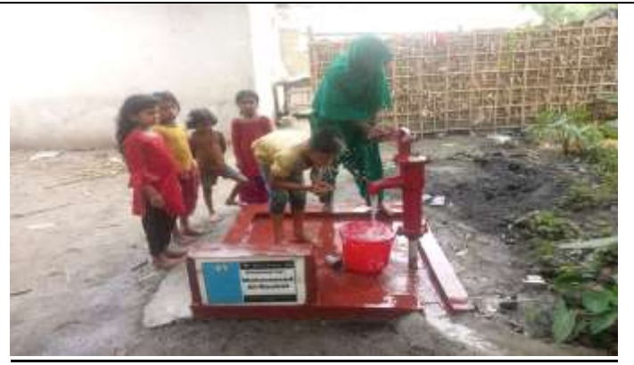
Hand Pump ( Well No:042