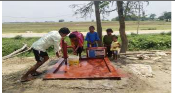
Hand Pump ( Well No:050