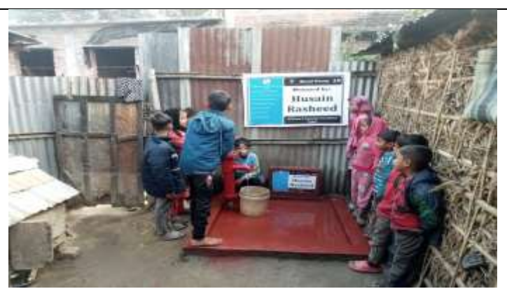
Hand Pump ( Well No:019)