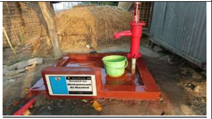
Hand Pump ( Well No:040