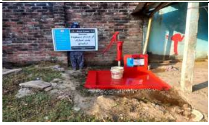
Hand Pump ( Well No:014)