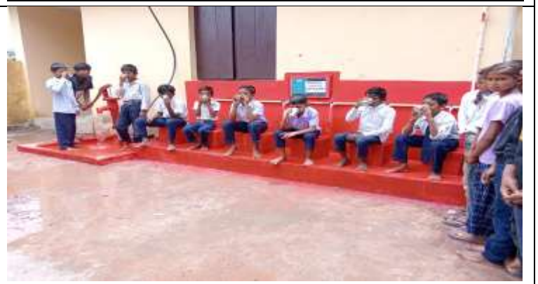
Electric Pump ( Well No:057