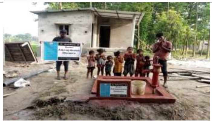
Hand Pump ( Well No:006)