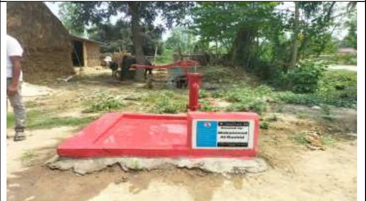
Hand Pump ( Well No:052