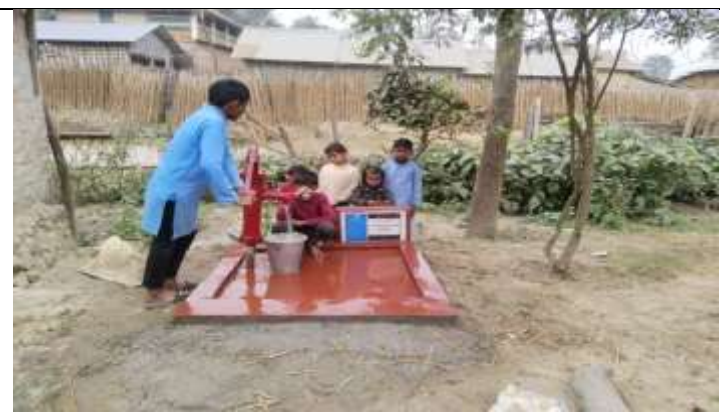
Hand Pump ( Well No:021)