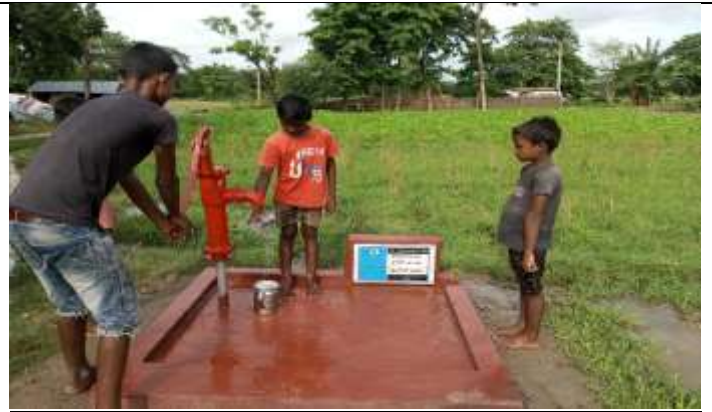
Hand Pump ( Well No:058