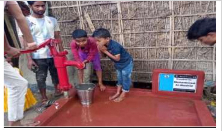
Hand Pump ( Well No:034