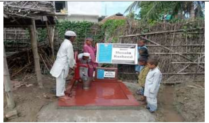
Hand Pump ( Well No:012)