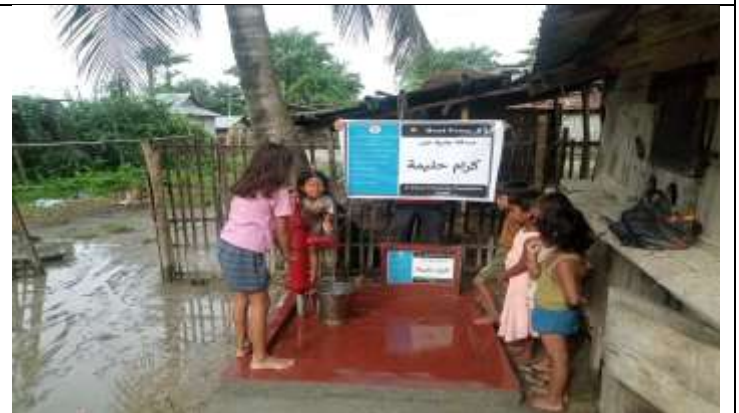
Hand Pump ( Well No:011)