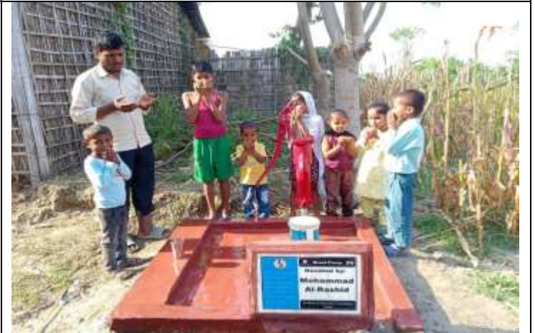
Hand Pump ( Well No:026)