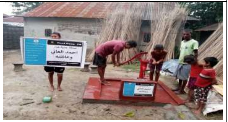
Hand Pump ( Well No:010)