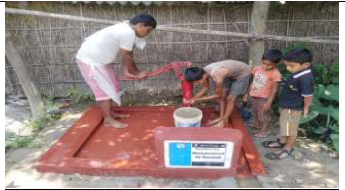
Hand Pump ( Well No:048