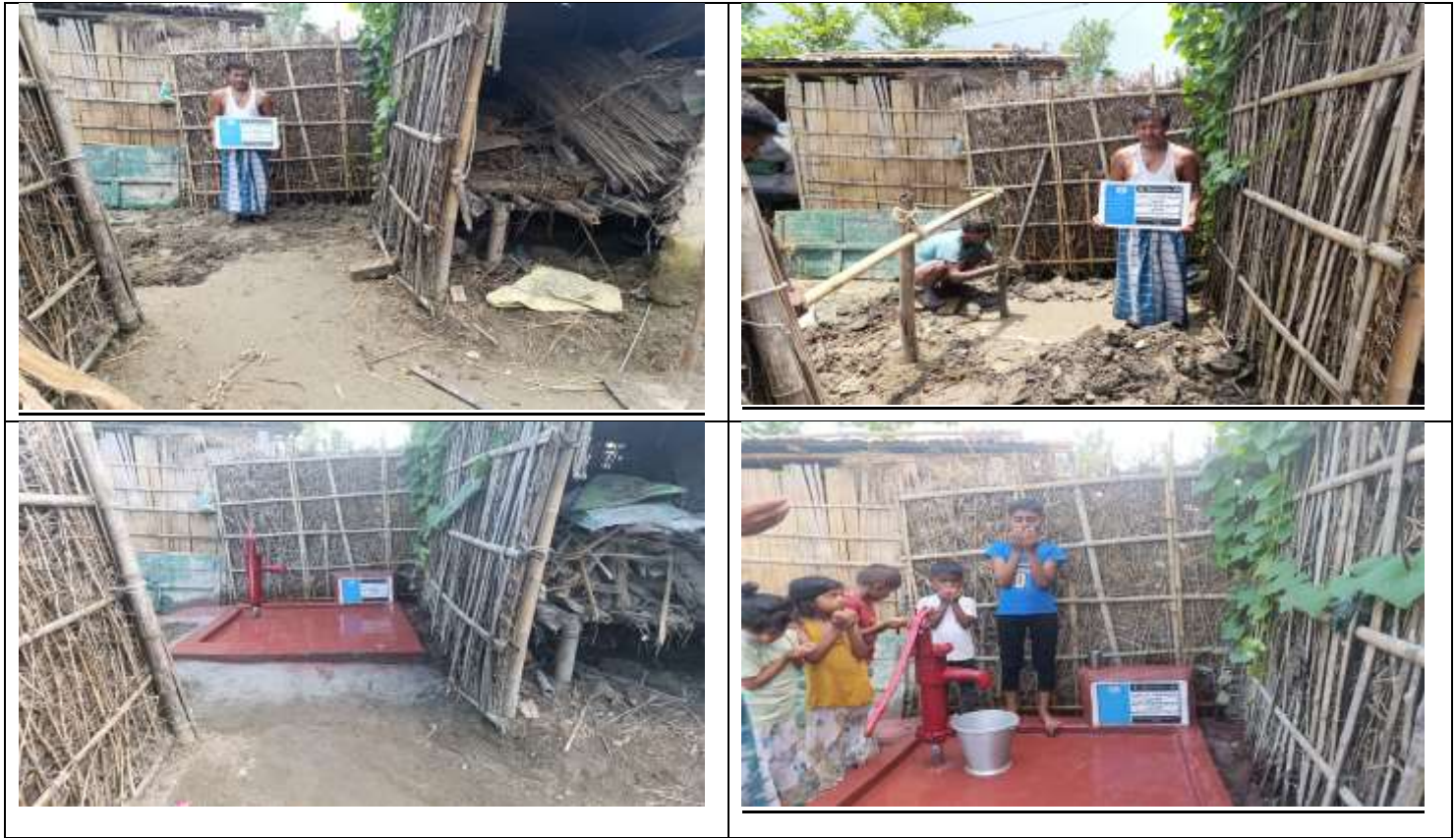
Hand Pump ( Well No:062