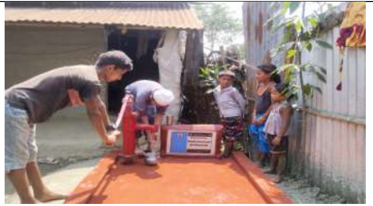
Hand Pump ( Well No:046