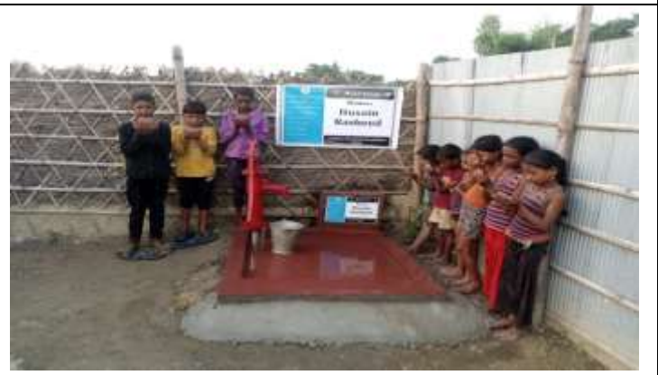
Hand Pump ( Well No:008)