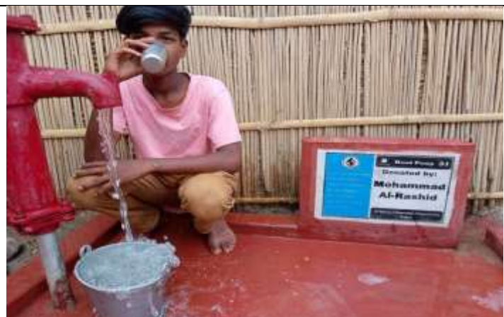
Hand Pump ( Well No:031)