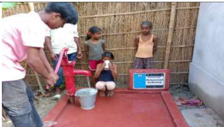
Hand Pump ( Well No:028)