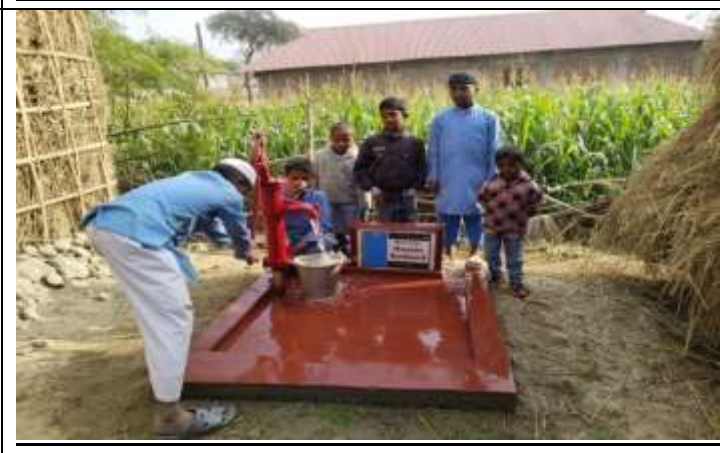
Hand Pump ( Well No:020)