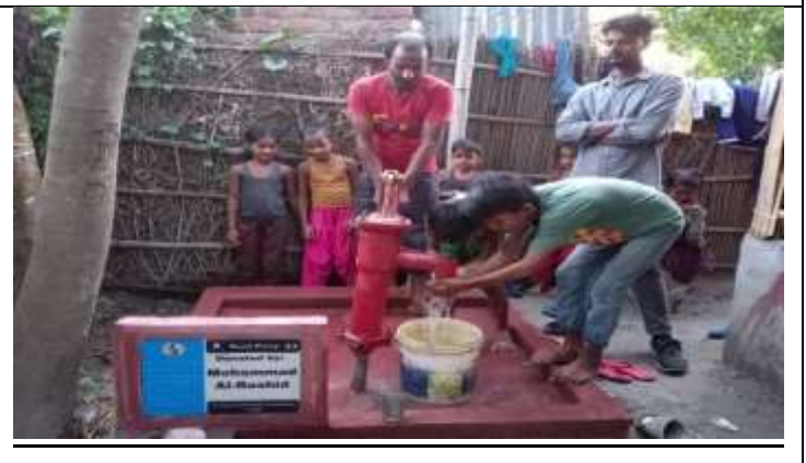
Hand Pump ( Well No:035