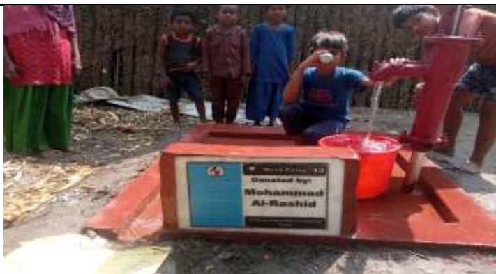
Hand Pump ( Well No:043