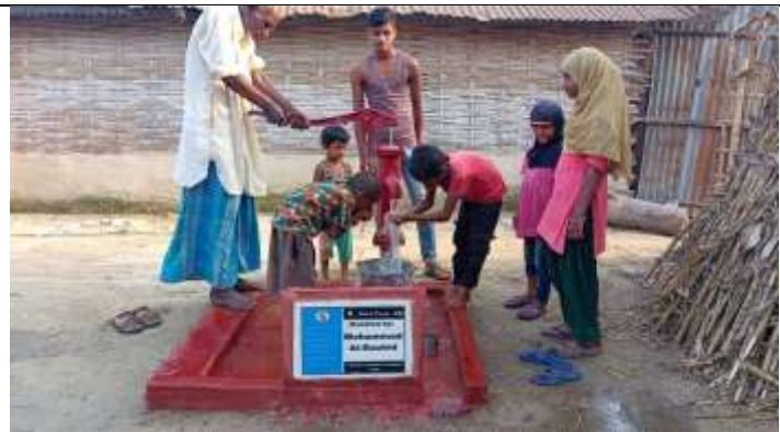
Hand Pump ( Well No:030)