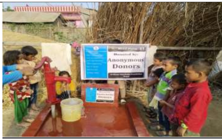
Hand Pump ( Well No:017)