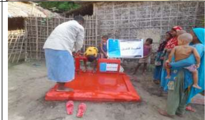
Hand Pump ( Well No:003)