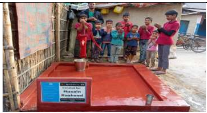
Hand Pump ( Well No:022)