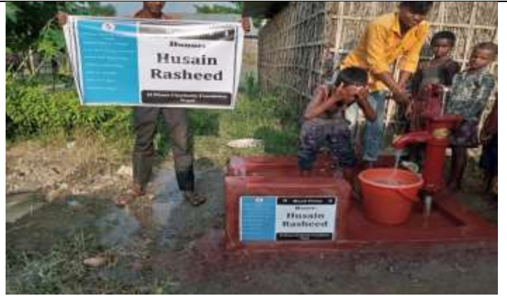
Hand Pump ( Well No:004)