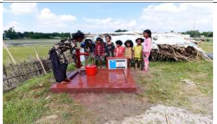
Hand Pump ( Well No:061