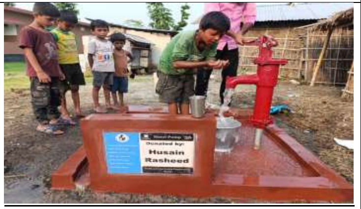
Hand Pump ( Well No:056