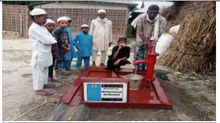
Hand Pump ( Well No:044