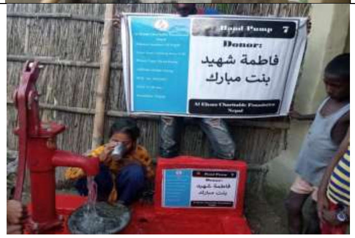
Hand Pump ( Well No:007)