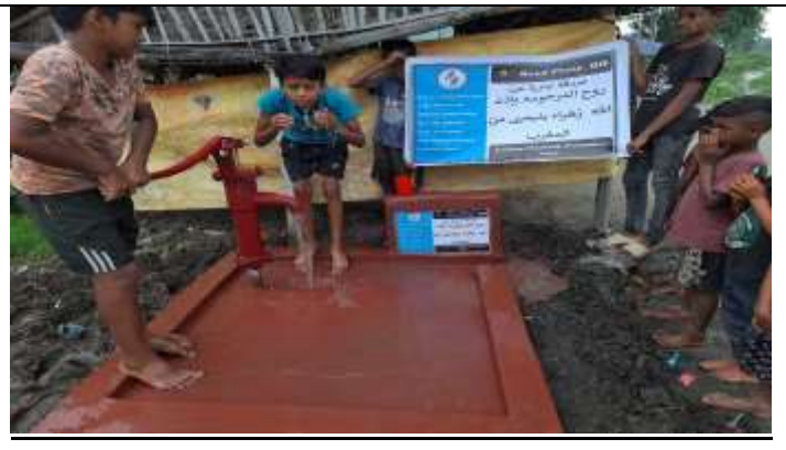
Hand Pump ( Well No:060