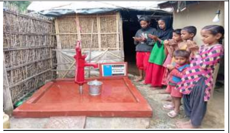
Hand Pump ( Well No:032