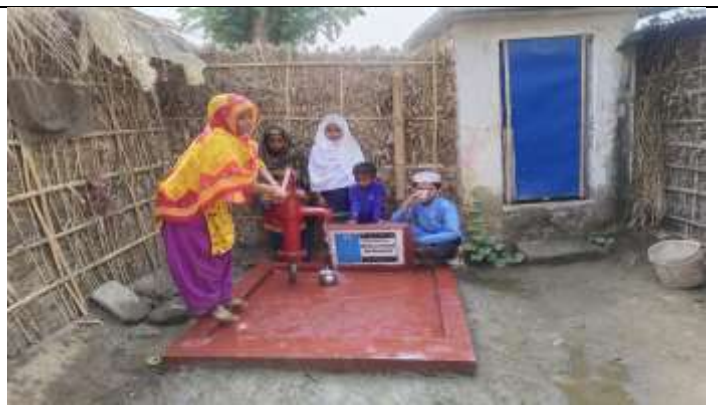
Hand Pump ( Well No:049