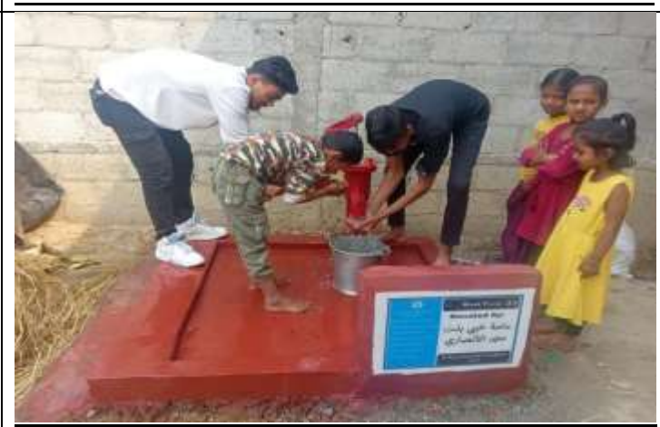
Hand Pump ( Well No:023)