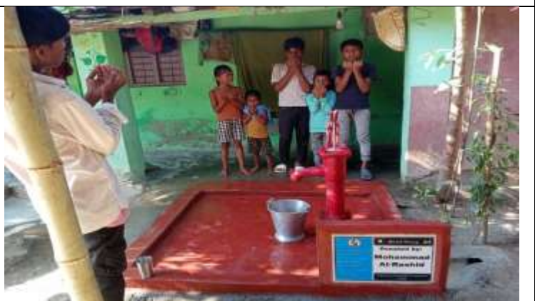
Hand Pump ( Well No:027)