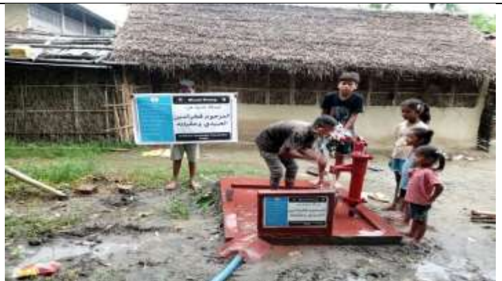
Hand Pump ( Well No:009)