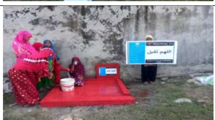
Hand Pump ( Well No:015)