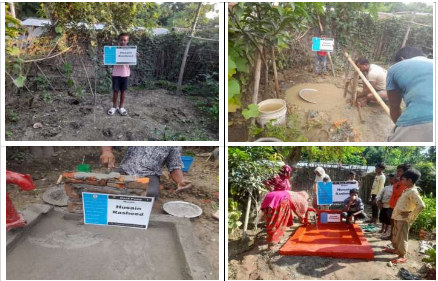
Hand Pump ( Well No:001)