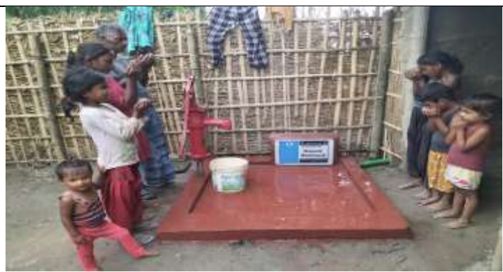
Hand Pump ( Well No:055