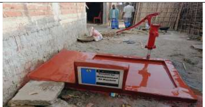
Hand Pump ( Well No:037