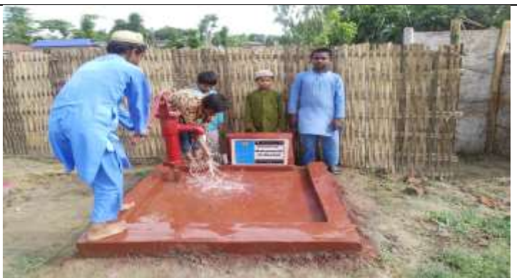
Hand Pump ( Well No:047