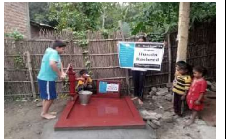
Hand Pump ( Well No:013)