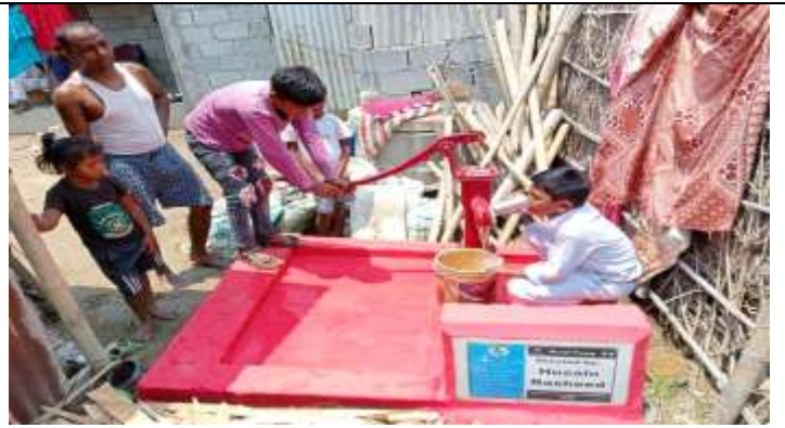
Hand Pump ( Well No:054