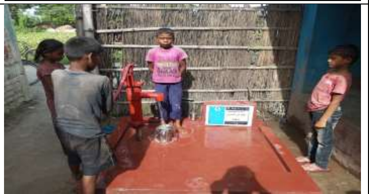
Hand Pump ( Well No:059