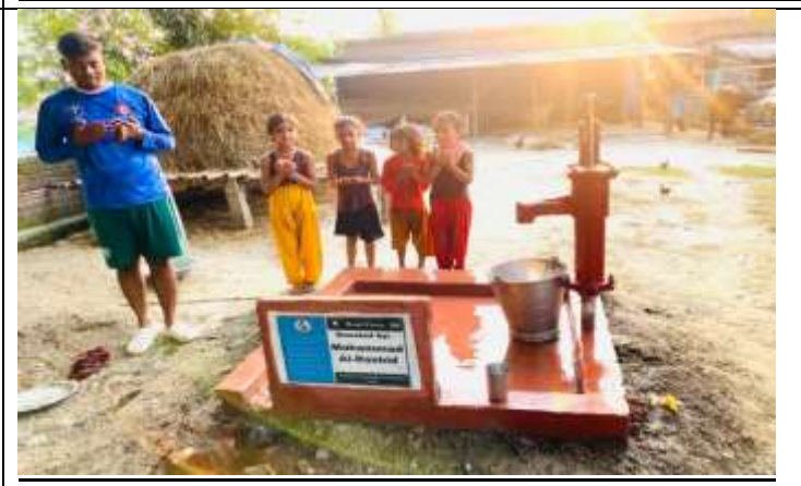
Hand Pump ( Well No:029)