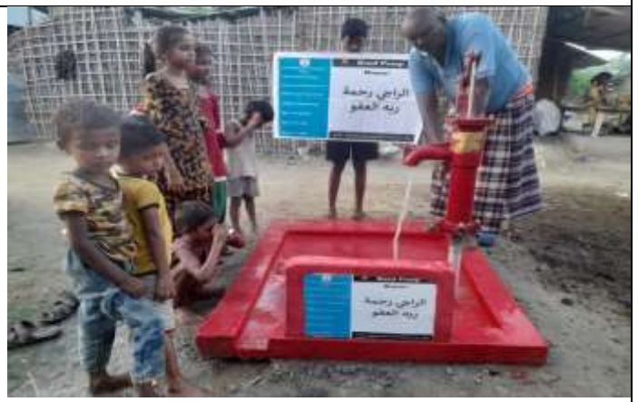
Hand Pump ( Well No:002)