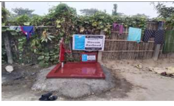
Hand Pump ( Well No:016)