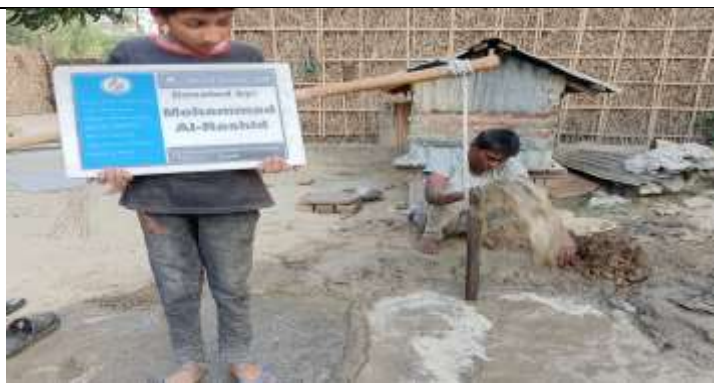
Hand Pump ( Well No:038