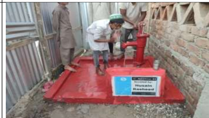
Hand Pump ( Well No:025)