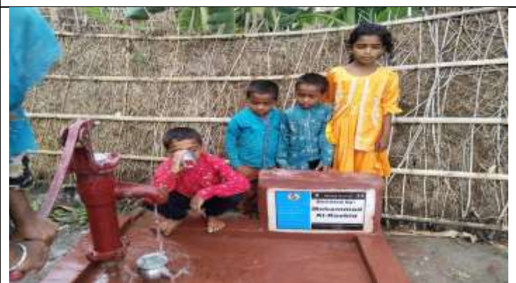
Hand Pump ( Well No:053