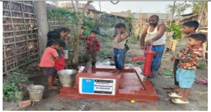
Hand Pump ( Well No:036