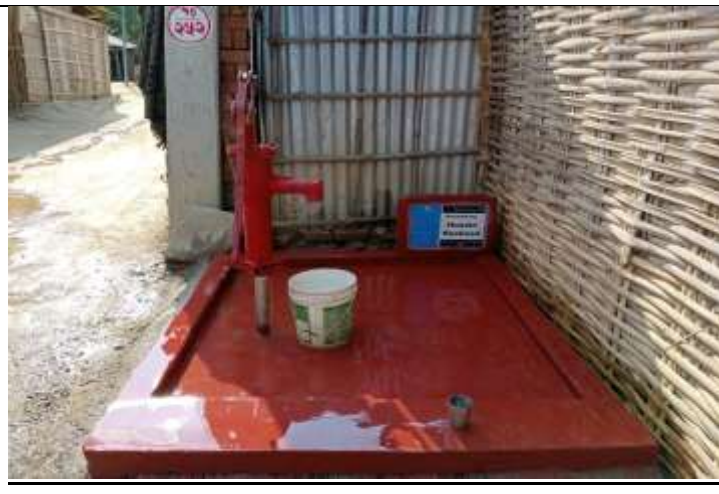
Hand Pump ( Well No:024)