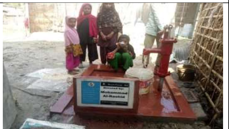
Hand Pump ( Well No:041