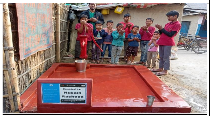
Hand Pump ( Well No:022)