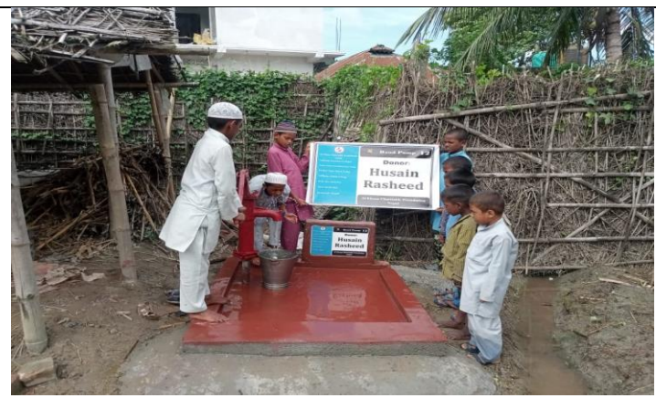
Hand Pump ( Well No:012)