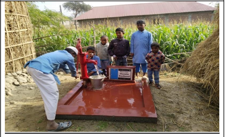
Hand Pump ( Well No:020)