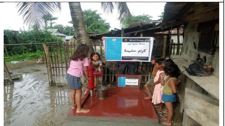
Hand Pump ( Well No:011)