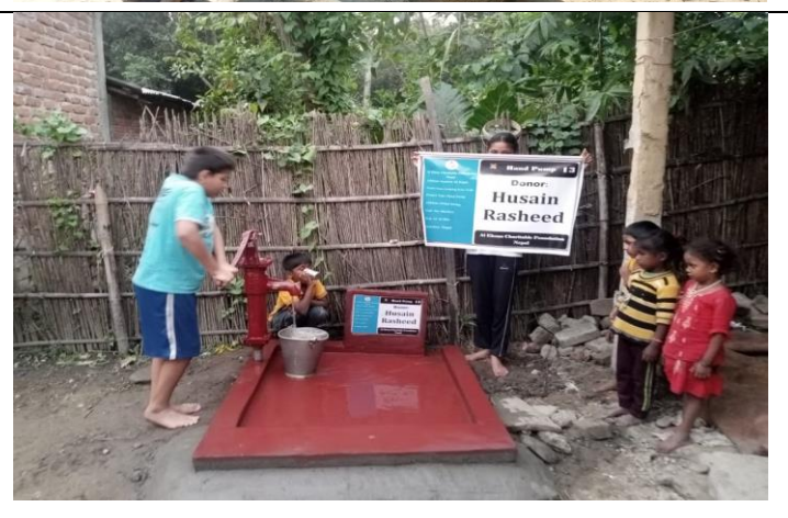
Hand Pump ( Well No:013)