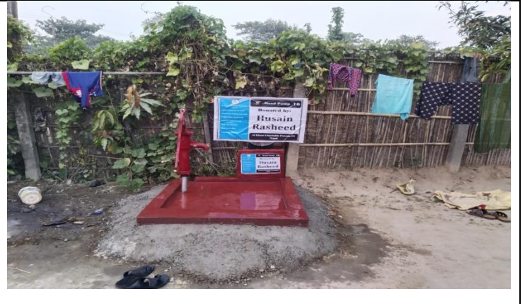
Hand Pump ( Well No:016)