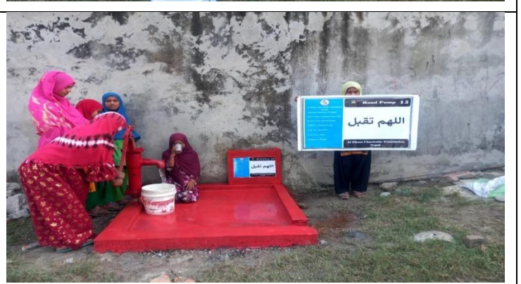
Hand Pump ( Well No:015)