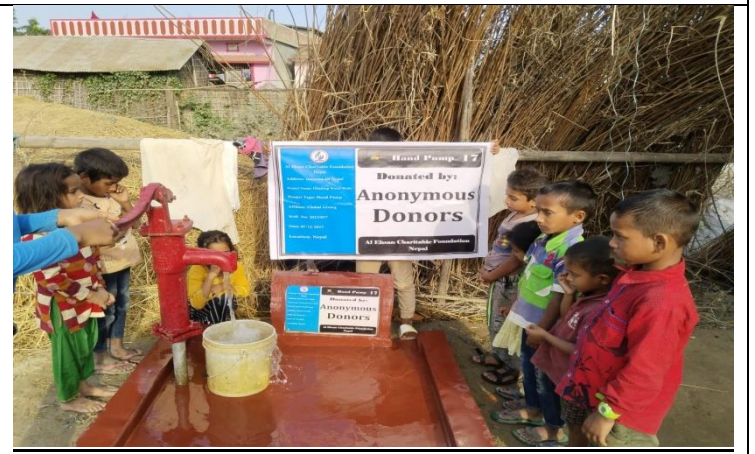
Hand Pump ( Well No:017)