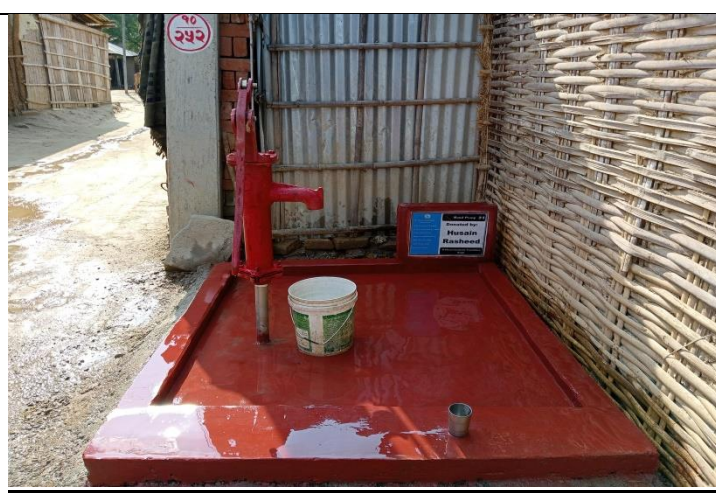
Hand Pump ( Well No:024)