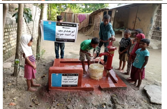
Hand Pump ( Well No:005)