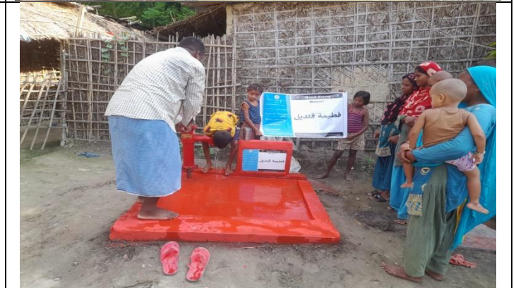
Hand Pump ( Well No:003)