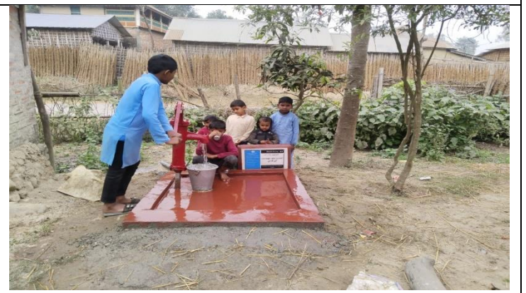
Hand Pump ( Well No:021)