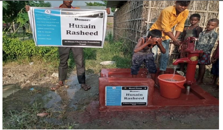
Hand Pump ( Well No:004)