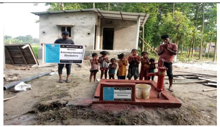
Hand Pump ( Well No:006)