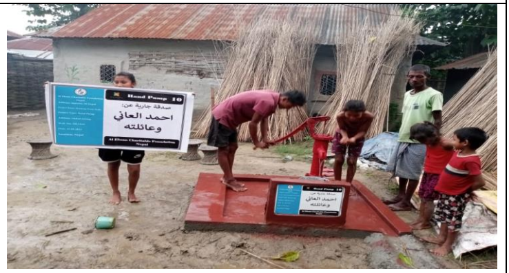
Hand Pump ( Well No:010)