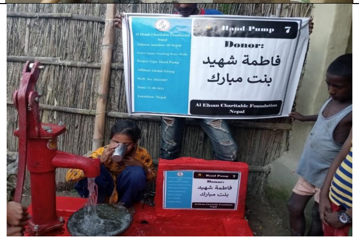
Hand Pump ( Well No:007)