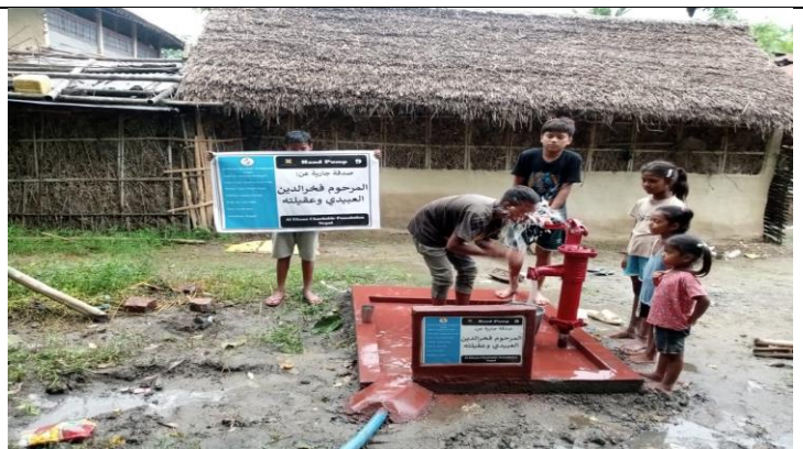
Hand Pump ( Well No:009)