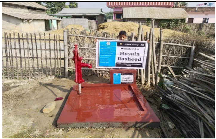
Hand Pump ( Well No:018)