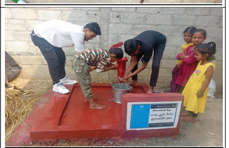
Hand Pump ( Well No:023)