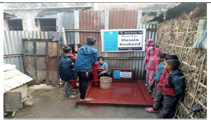
Hand Pump ( Well No:019)