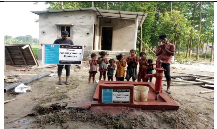
Hand Pump ( Well No:006)