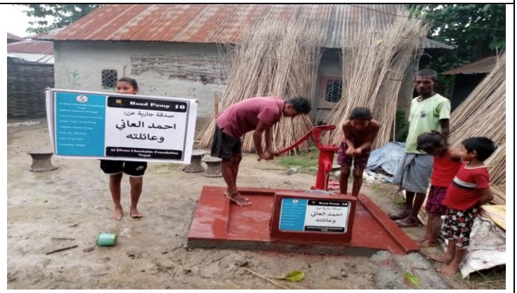
Hand Pump ( Well No:010)