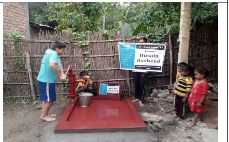
Hand Pump ( Well No:013)