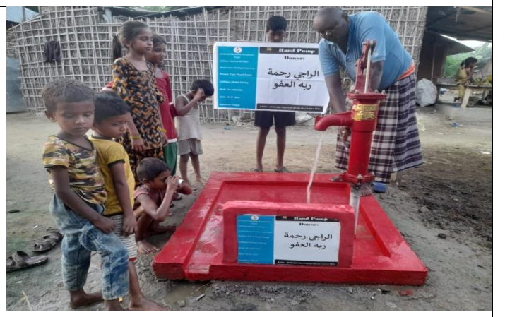
Hand Pump ( Well No:002)