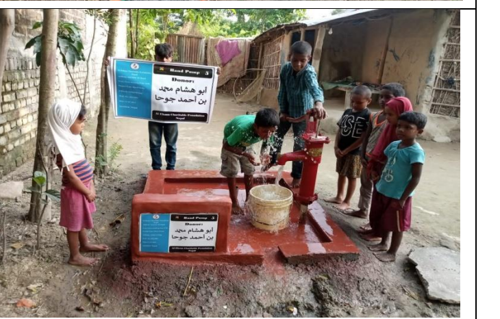
Hand Pump ( Well No:005)