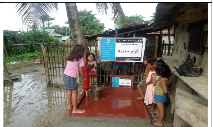
Hand Pump ( Well No:011)