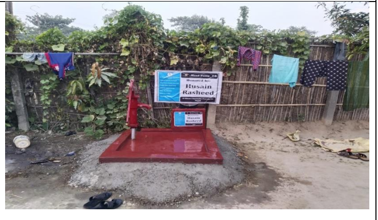
Hand Pump ( Well No:016)