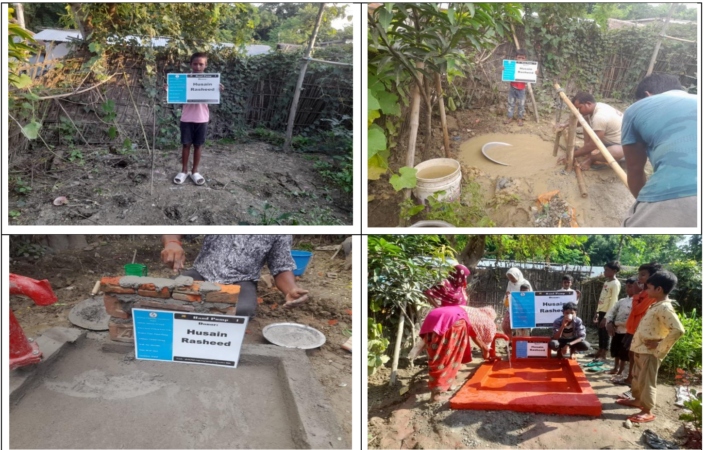
Hand Pump ( Well No:001)