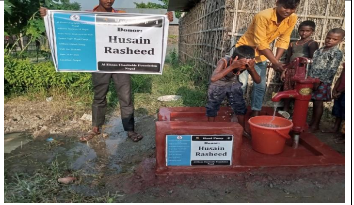
Hand Pump ( Well No:004)