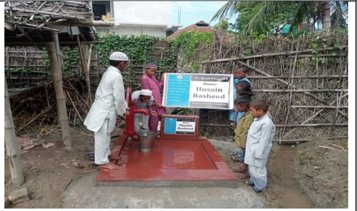
Hand Pump ( Well No:012)