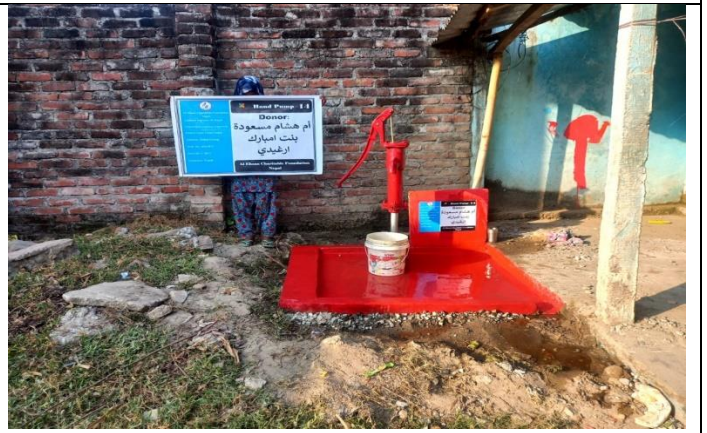
Hand Pump ( Well No:014)