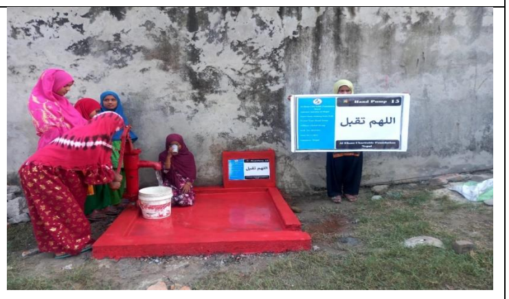
Hand Pump ( Well No:015)