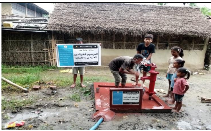
Hand Pump ( Well No:009)