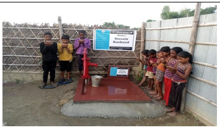
Hand Pump ( Well No:008)