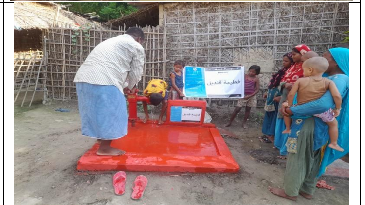
Hand Pump ( Well No:003)