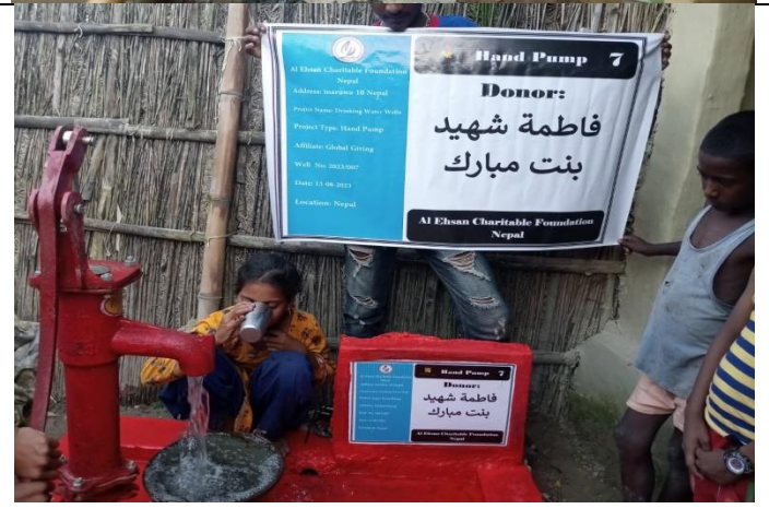
Hand Pump ( Well No:007)