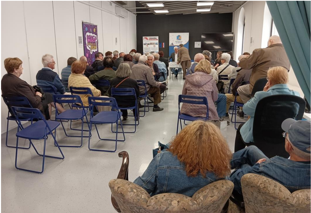
Thematic lectures for citizens are held once a month. The topics of the lectures are current challenges faced by the citizens of Karlovac.