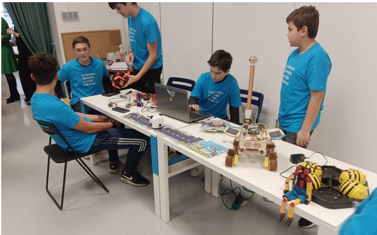
Fair of young innovators. Primary school students present their innovations in the field of STEM.