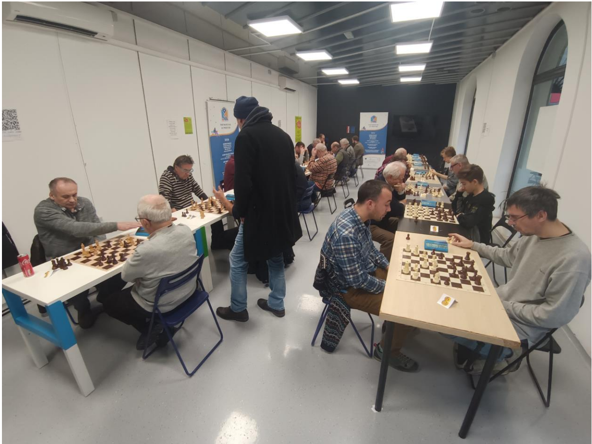
Chess tournament, takes place every Wednesday. It gathers 53 players of all ages, and every other weekend they hold away tournaments in which chess players from all over Croatia take part.