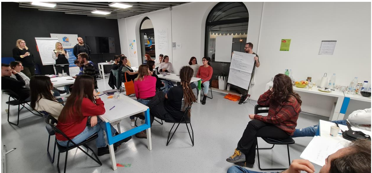
Trainings for youth workers where the latest methods are learned and tools are exchanged in working with young people. The topics are different - human rights, inclusion, intercultural learning, active citizenship, volunteering, culture and art, sustainable development, inclusion of marginalized groups, approach in working with the NEET group of young people. Also, trainings are held to strengthen the capacity of CSOs on different topics.