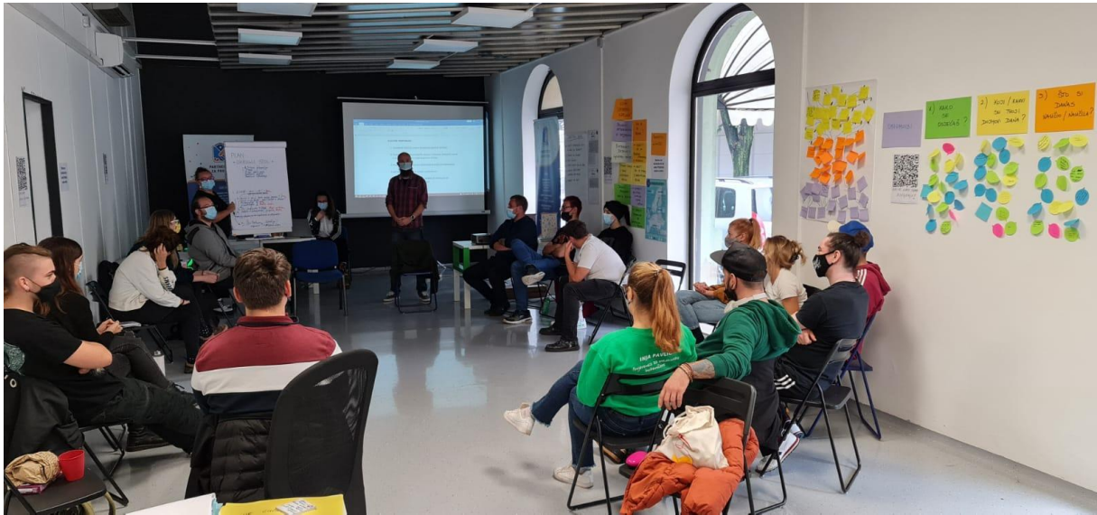
The community center Prostorija also hosts youth initiatives. In this photo, young people are taught how to communicate with decision makers.