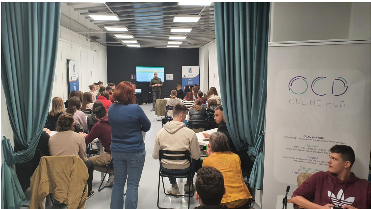
Quiz competitions are held twice a month.