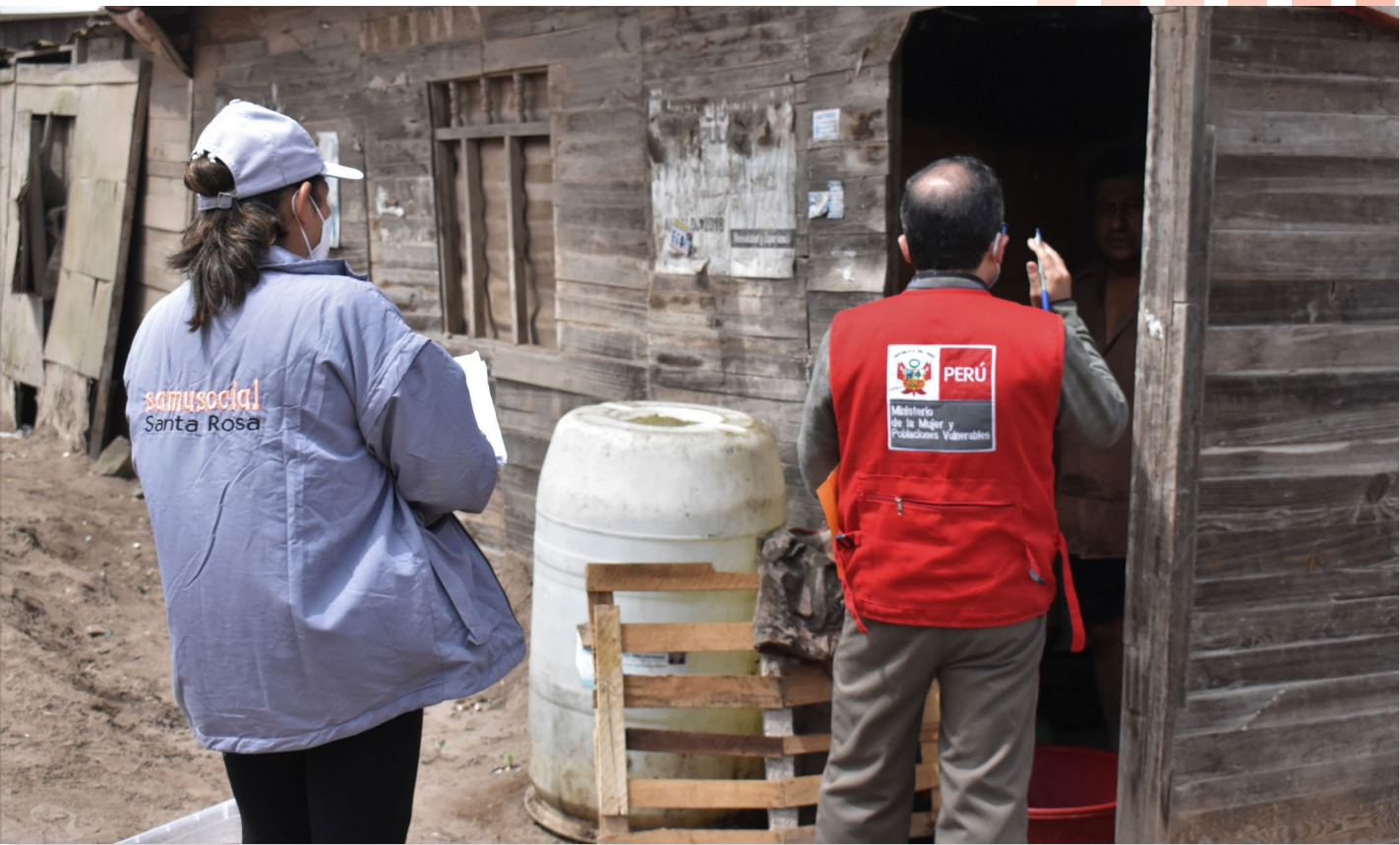
Samusocial and the Women's Emergency Center visit a woman to give her support.