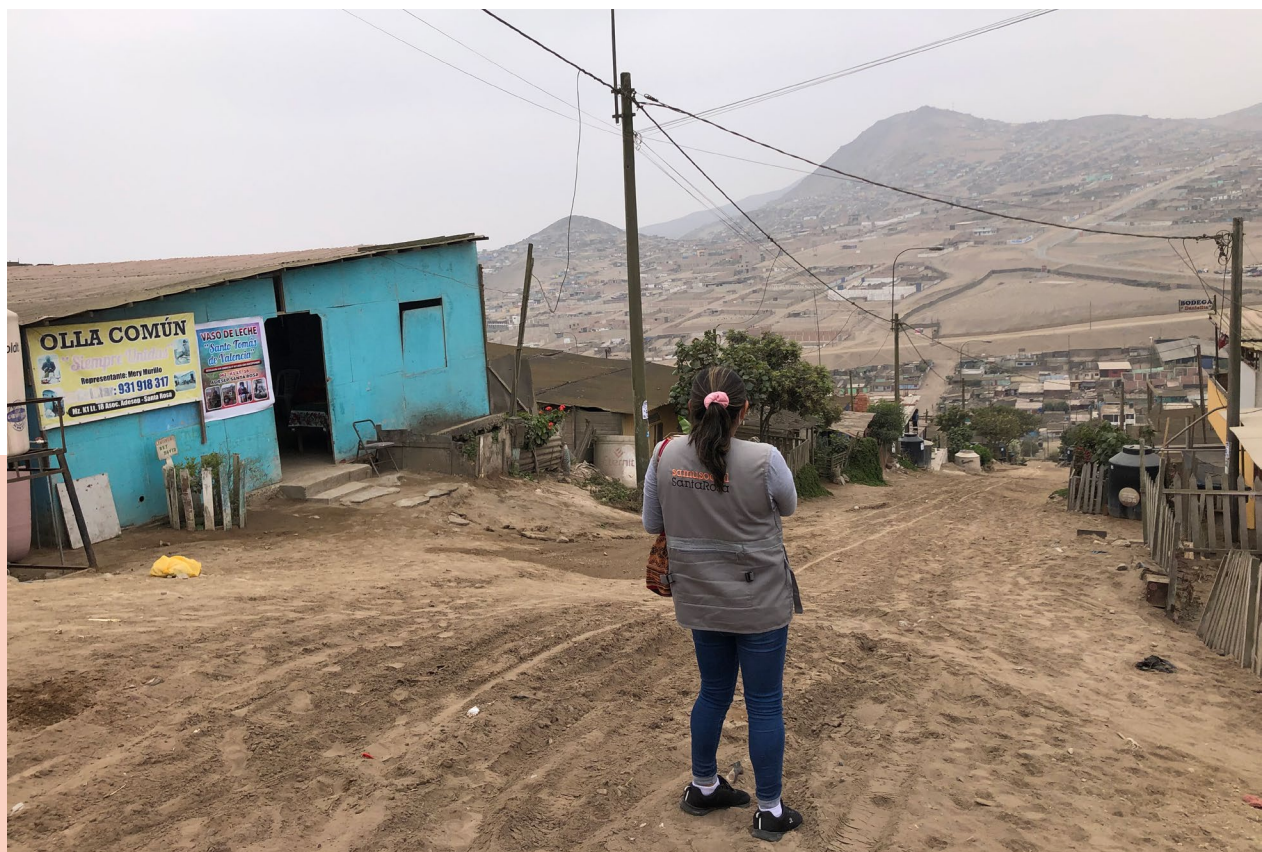
Samusocial Perú goes to meet vulnerable people.