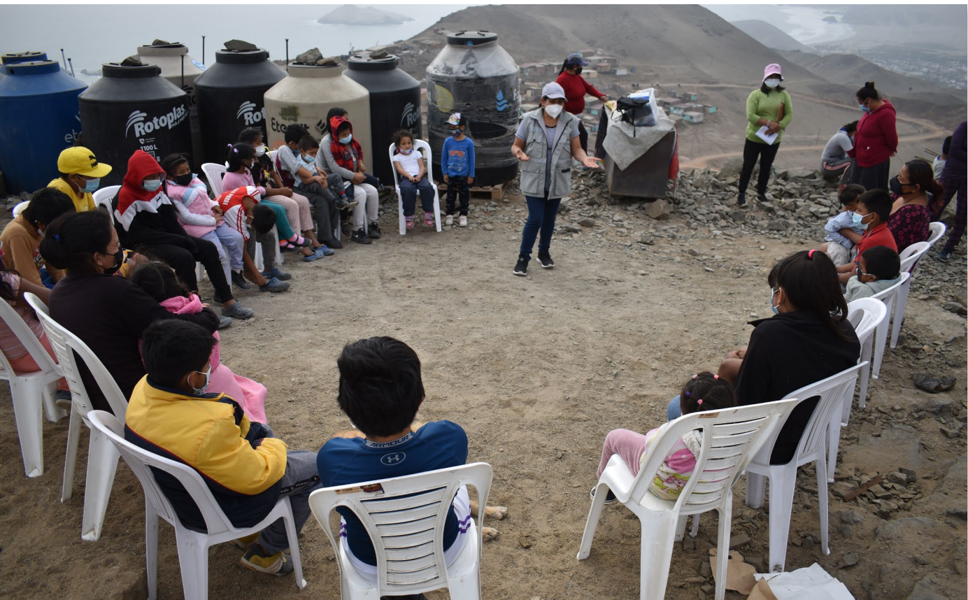
Children in a workshop strengthen their soft skills.