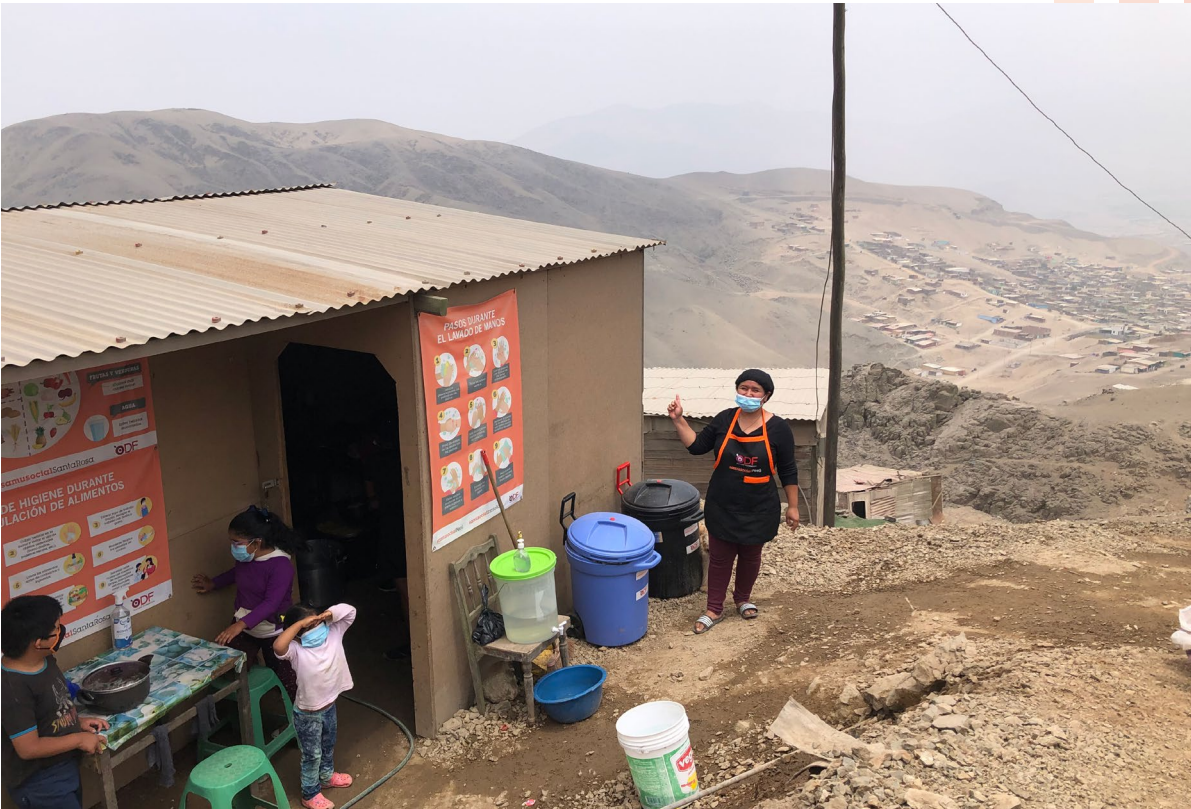
Support for Common Pots for their strengthening.