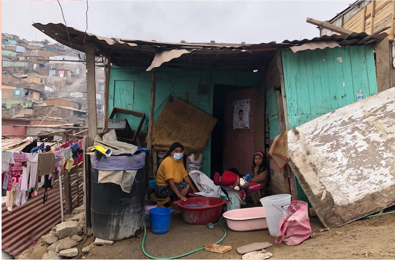
The life conditions.