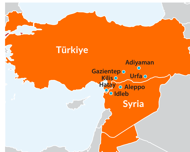
Map of World Vision Syria Response countries – showing where WORLD VISION SR is responding

In NW Syria, shelter and education are the two priority sectors. World Vision's rapid assessment noted that 94% of respondents reported their homes had been damaged in the earthquake . Half the people we spoke to said the house had been destroyed. In the education sector, 84% of needs assessment respondents reported that the quake had negatively affected their ability to access education for their children. Many schools were damaged, and over 100 are used as temporary shelters for displaced people. Multi-purpose cash remains one of the most effective modalities for delivering aid since the underlying vulnerabilities of the population mean that households have varying needs.