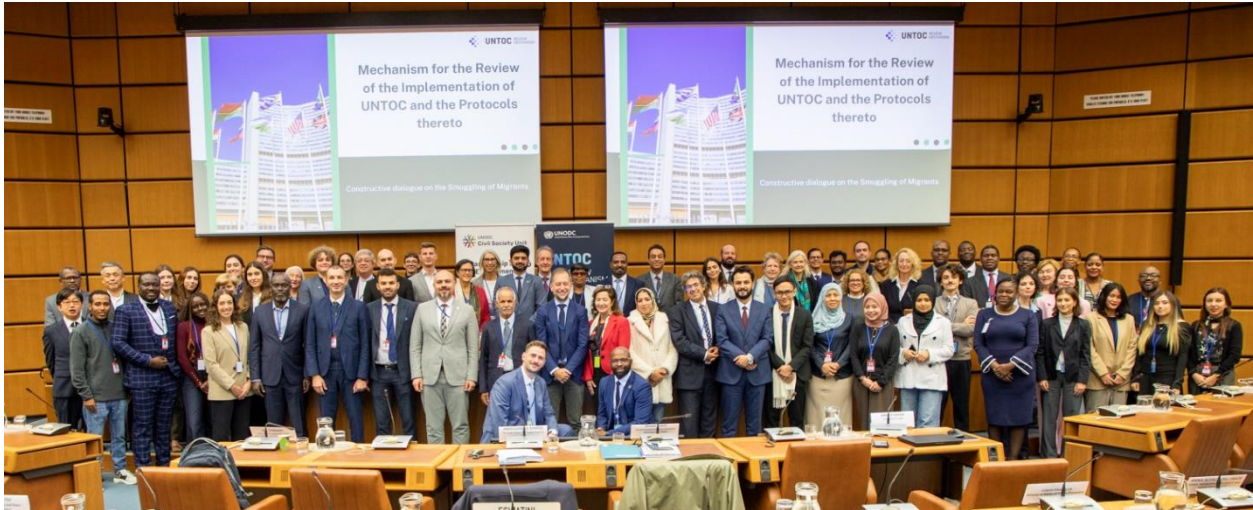
The Constructive Dialogue on Trafficking of persons, and Smuggling of Migrants organized by the UNODC on 08 and 13 October 2025 at the Vienna International Center (VIC) in Austria.