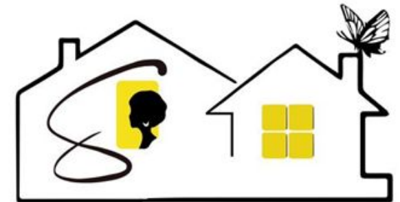
THE SHOLLY SERENITY PLACE