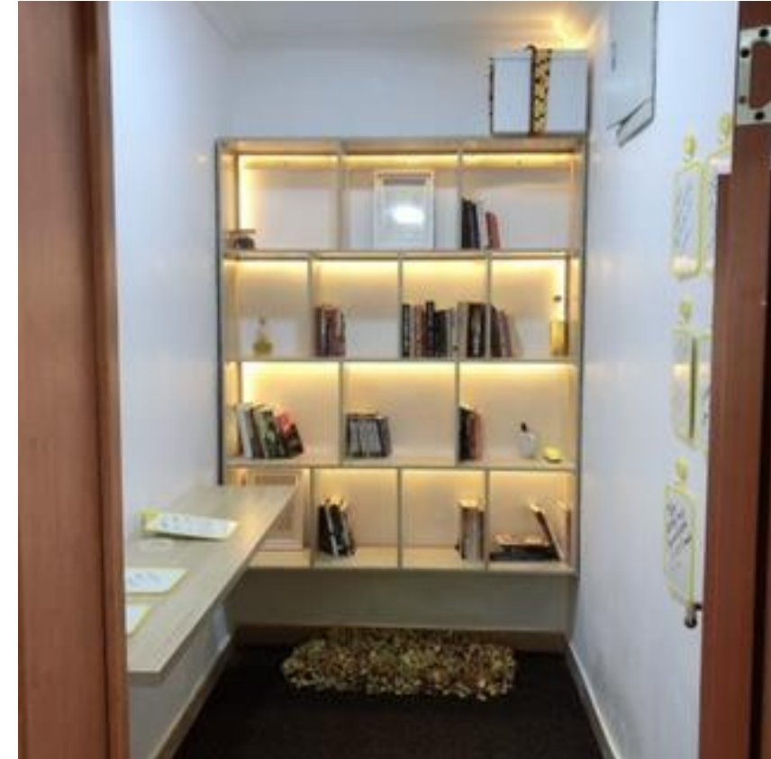
Our War Room Aka Prayer Closet

This document will be shared with the Lagos State Government early in 2024 and we will upload a copy on our Global Giving portal..