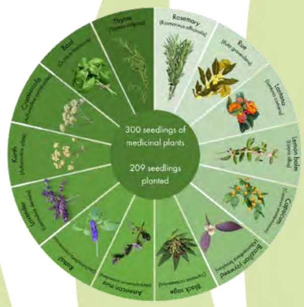
The medicinal plants

We're also growing medicinal plants for use in our workshops, and this year we grew 300 plants including: American mint, Basil, Black sage, Brazilian Joyweed, Capsicum, Crassiuscula, Lantana. Lavender, Lemon balm, Kunth, Rattail, Rosemary, Rue and Thyme.