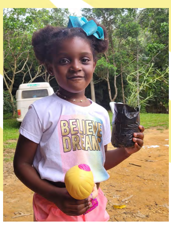
A young dreamer with her tree sapling

We also reached 400 children in other local schools, giving them their first taste of rainforest science, and we hosted a further 300 children and their teachers for day-long workshops of forest immersion, which left them clamoring for more.