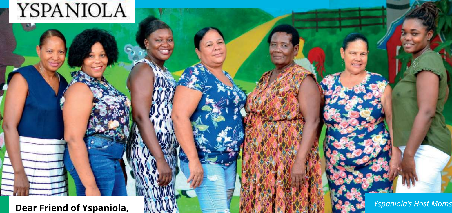
Yspaniola's Host Moms