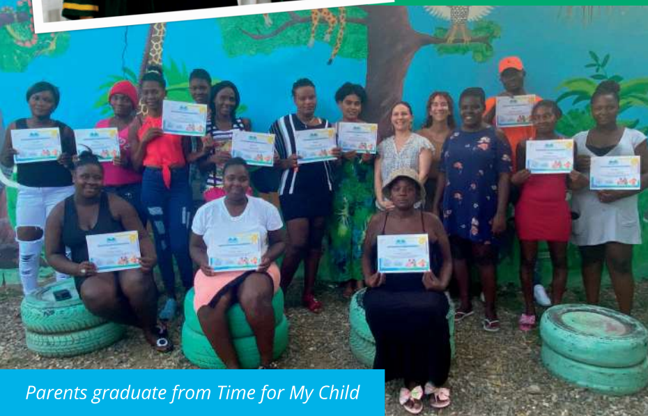
Parents graduate from Time for My Child