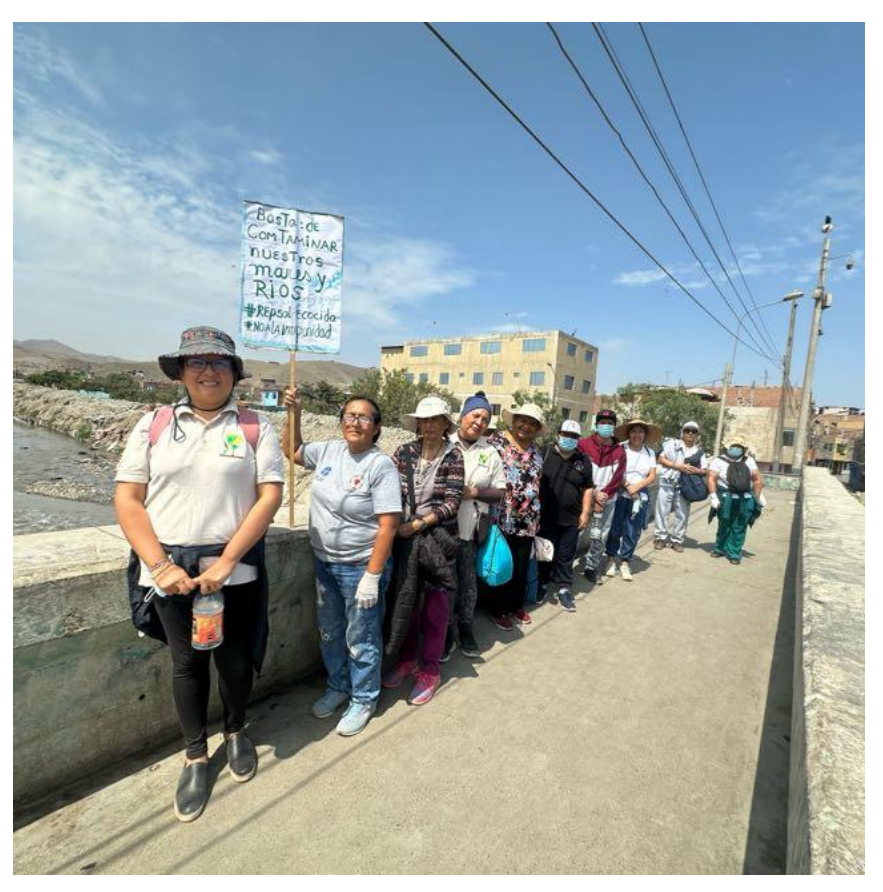
Pictures 3 and 4. The group that went on the excursion to promote slogans alluding to the care and protection of the lagoon.