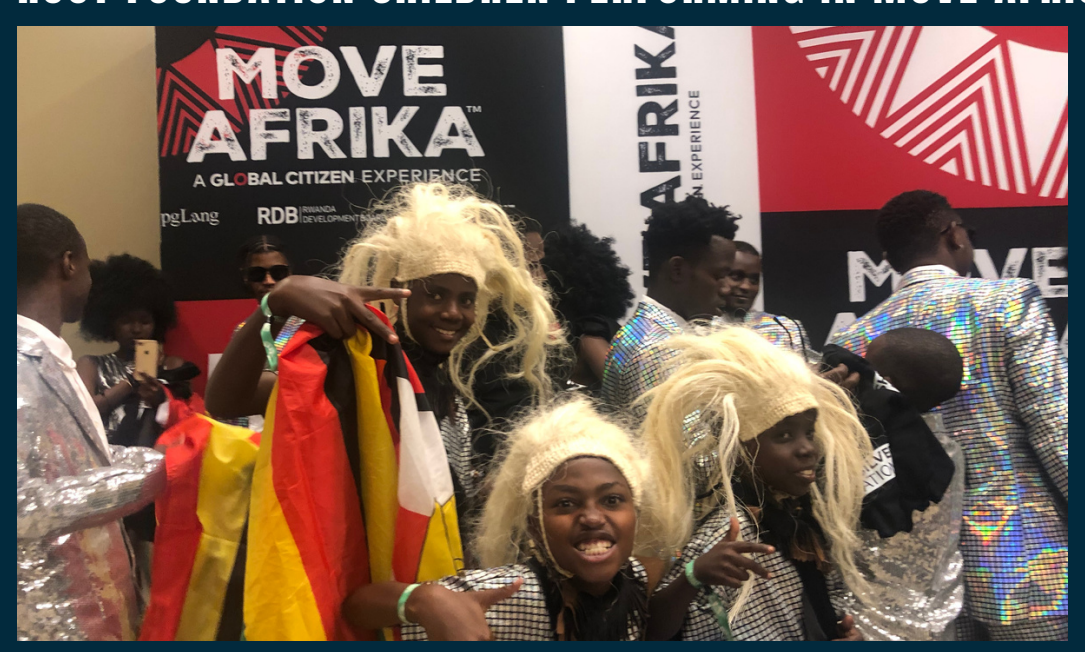
ROOT FOUNDTION IN TEDX KIGALI