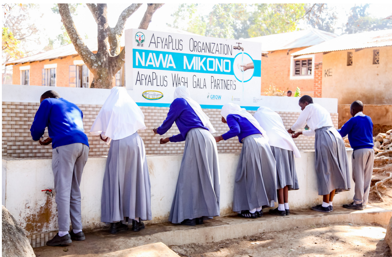
Fig 4: Students of Miyomboni secondary school practising proper hand washing procedures.

The project is going to serve 2909 students ( 1228 boys and 1681 girls), teachers, and other workers. Out of 2909 students, 528 (236 boys and 292 girls) were from Kalenga Primary School, 918(375 boys and 543 girls) were from Kalenga secondary school, 545 (242 boys and 303 girls) from Miyomboni secondary school, and 918 (375 boys and 543 girls) from Mkwawa secondary school.