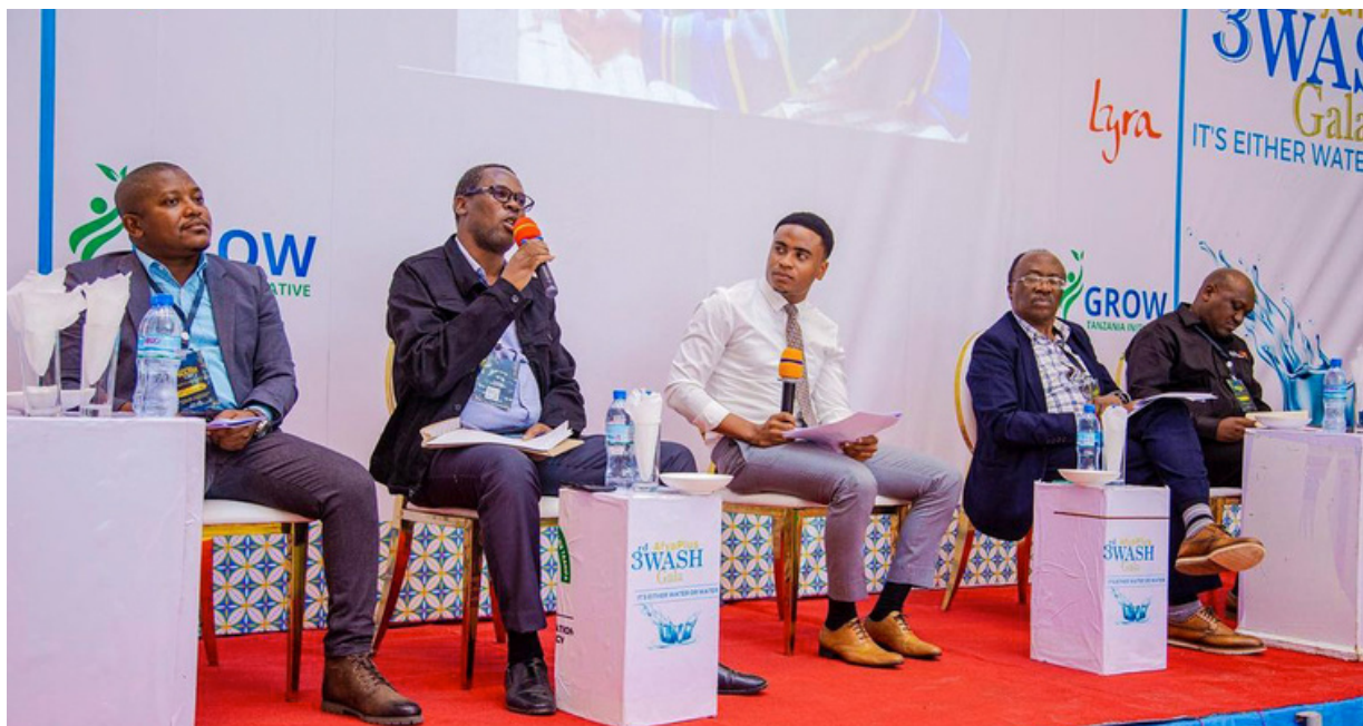
Fig.3. Our speaker's team during the event preserved the memory, after delivering different topics concerning the theme "It's either water or water" during Afyaplus 3rd WASH Gala.

Afyaplus organization really appreciates the panelist team, leaders from local government authorities, school management teams, representatives from NGOs, Companies, institutes, and other invitees for their valuable contribution to how we can improve Water Sanitation and hygiene (WASH) services in schools of Iringa.