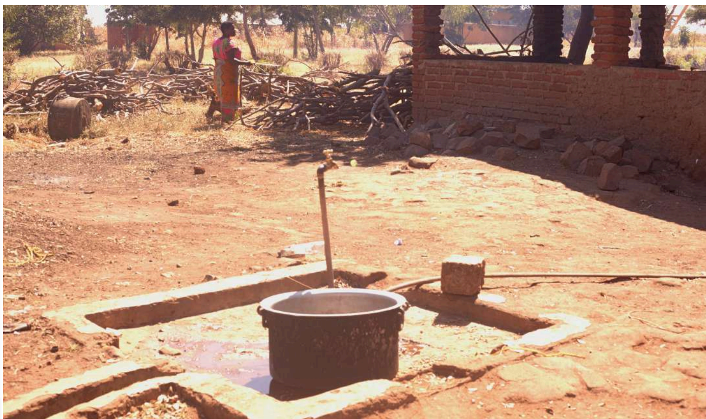
Hand washing station observed during the baseline survey in Isimani secondary school. The station has one water tap, serving 1057 students and other staff in the school.

The water infrastructure is severely inadequate, with only one water tap available for 1067 students and their teachers. This situation poses a significant challenge as the limited water supply is insufficient to meet the needs of the school population. The disparity in the number of girls (724) and boys (343) further exacerbates the issue, as it indicates a higher demand for water facilities among female students.