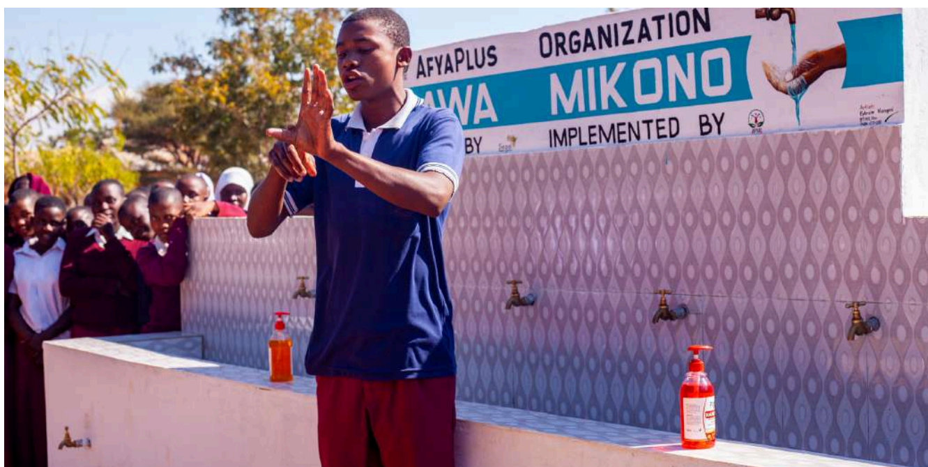
Student at Isimani Secondary School in Iringa District Council demonstrating hand washing procedures to his fellow students during awareness session.

After successfully handing over the newly constructed hand-washing, Afyaplus has managed to conduct awareness of good sanitation and hygiene practices among 1747 students, as well as teachers and other school community members. Out of 1747, Irole Secondary School has 690 pupils (311 boys and 379 girls), whereas Isimani Secondary School has 1057 students (347 boys and 710 girls).