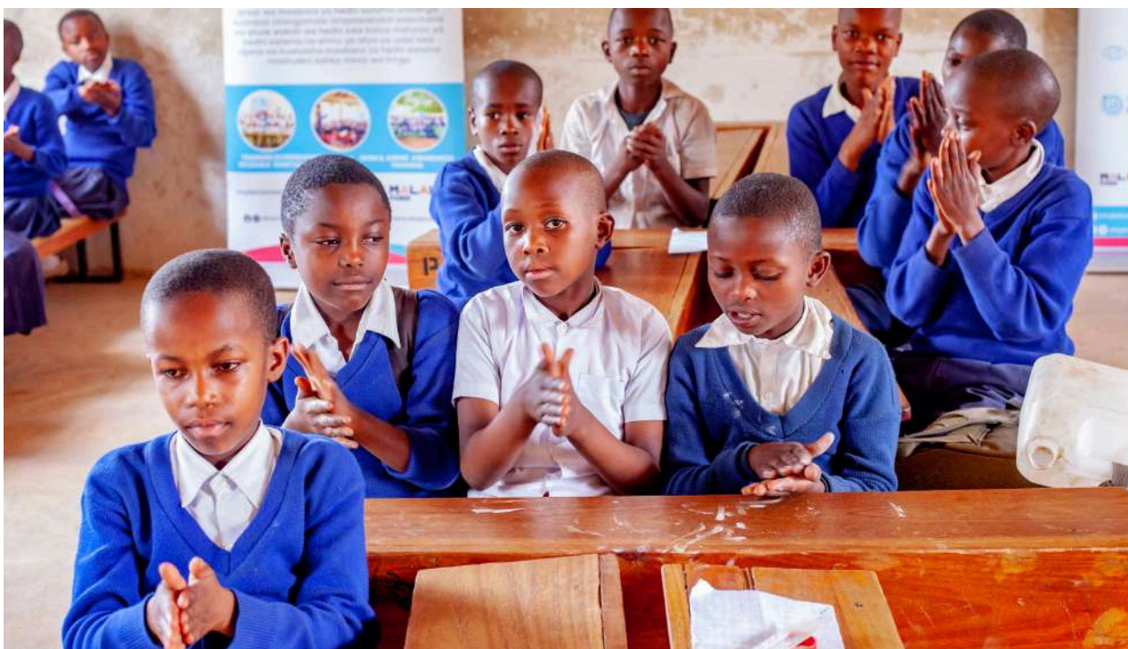
Pupils in Kigonzile primary school in Iringa Mc practicing proper hand washing procedures during a SWASH Club session

In this quarter, Afyaplus has managed to establish Afyaplus SWASH (school, Water, Sanitation, and Hygiene) clubs in 12 Schools located in both primary and secondary schools within the Iringa Municipal Council area. These clubs aim to instill lifelong habits and foster a culture of cleanliness. By targeting multiple schools, we strive to maximize our impact and provide young individuals with essential education on sanitation and hygiene practices.