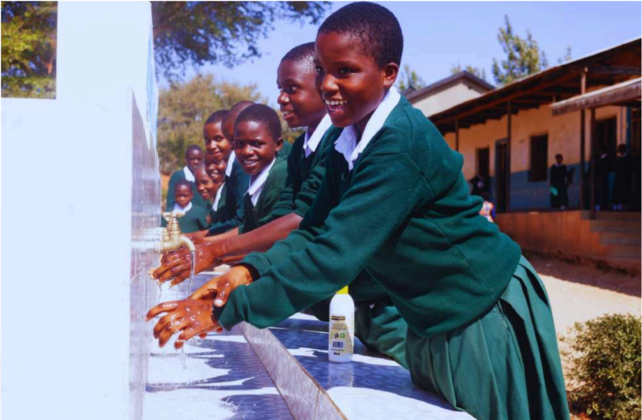
Students at Irole Secondary School in Kilolo District Council are diligently washing their hands, thanks to the efforts of AfyaPlus stakeholders in making this project a reality.

The project is inclusive for children with disabilities and aims to contribute towards Sustainable Development Goals 4 and 6. So far it has benefited 23,208 school children, teachers, and other school workers in 40 Iringa Regional Schools, by providing 25 storage facilities in 25 schools and constructing hand washing stations in 15 schools