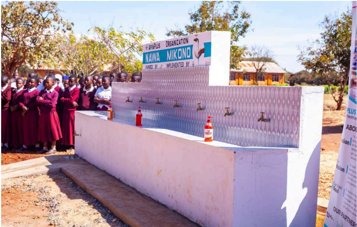
A completed hand washing station at Isimani secondary school which serves 1057 students ((347 boys and 710 girls).

During this reporting period, the Afyaplus Organization pursued its development strategy of preventing and controlling WASH-related diseases by implementing the Water Project in Tanzanian schools. The project focuses on the construction of hand washing stations in schools, the provision of WASH training to promote behavior change, and advocacy and lobbying for support from decision-makers, other WASH stakeholders, and the general public for improved WASH services in schools and communities.