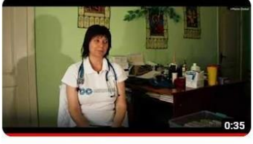
#Ucrania ¿Qué es lo primero que piden al personal médico quienes viven en el...

(HEALTH: the most urgent need to those fleeing from the conflict in Ukraine) (What is the first thing asked to health professionals...?)