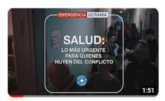
SALUD: lo más urgente para quienes huyen del conflicto en #Ucrania

(How is Médicos del Mundo providing medical care to communities...)