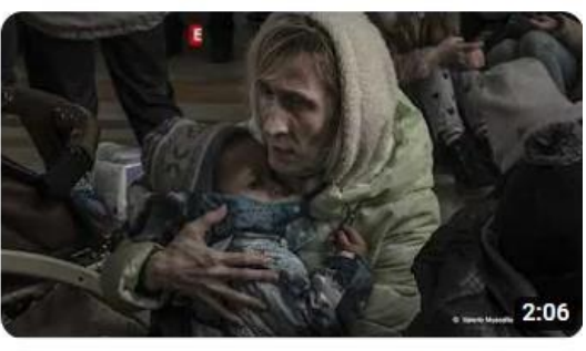
El personal sanitario sostiene la vida en la emergencia de #Ucrania

(A thank you to our Ukrainian personnel: "We keep working to support hospitals and civilians because people lack security)