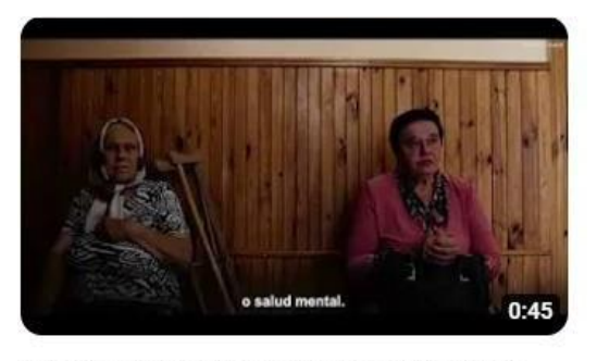
#Ucrania ¿Cómo lleva Médicos del Mundo la atención médica a las comunidades en...

(How is Médicos del Mundo providing medical care to communities...)