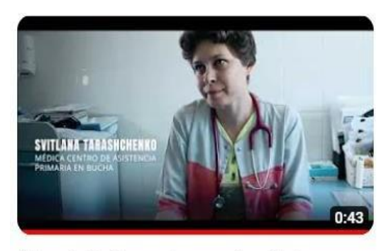
#Ucrania Qué hace el personal sanitario cuando no puede ofrecer a sus pacientes... (What do the health care personnel do when...?)