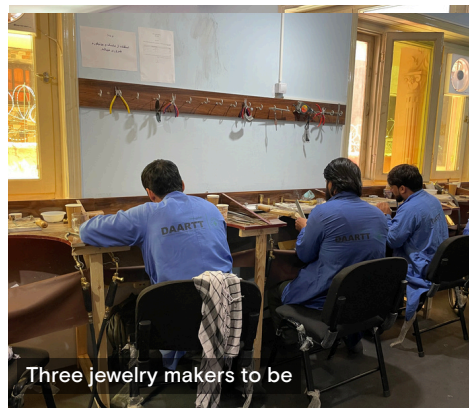
Three jewelry makers to be