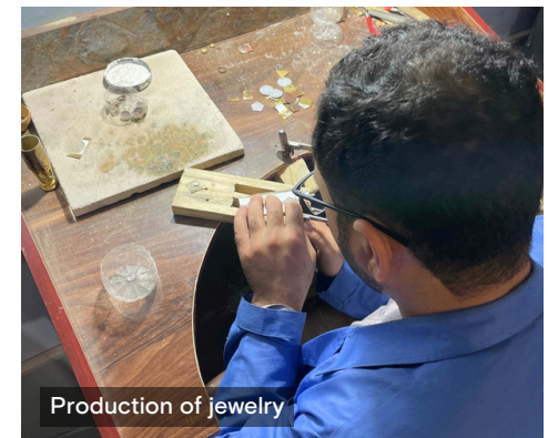
Production of jewelry