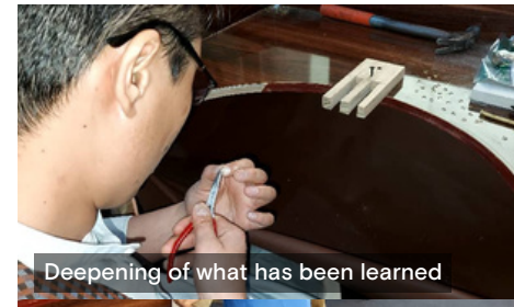
Deepening of what has been learned