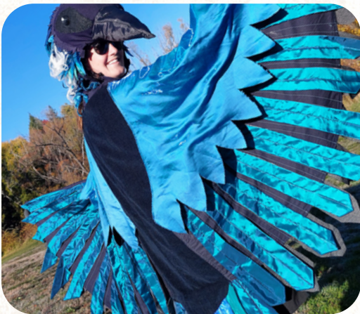
Action at Kirimoko