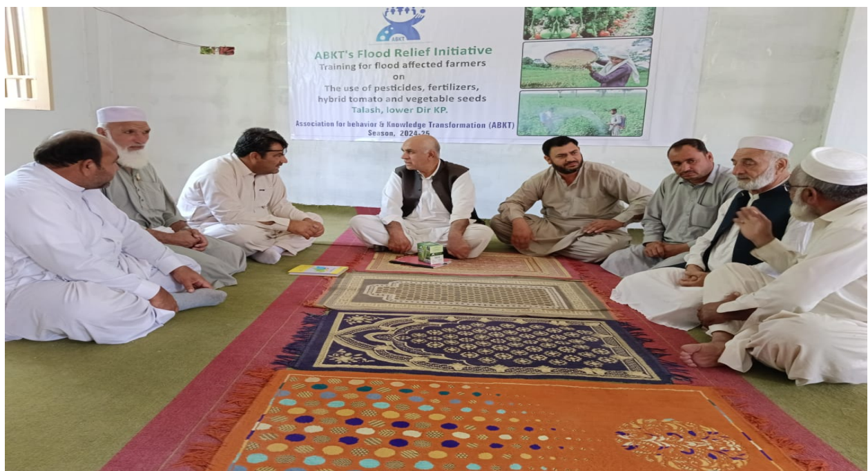
Training of Farmer Community affected by 2022 flood

Association for Behavior and Knowledge Transformation (ABKT)