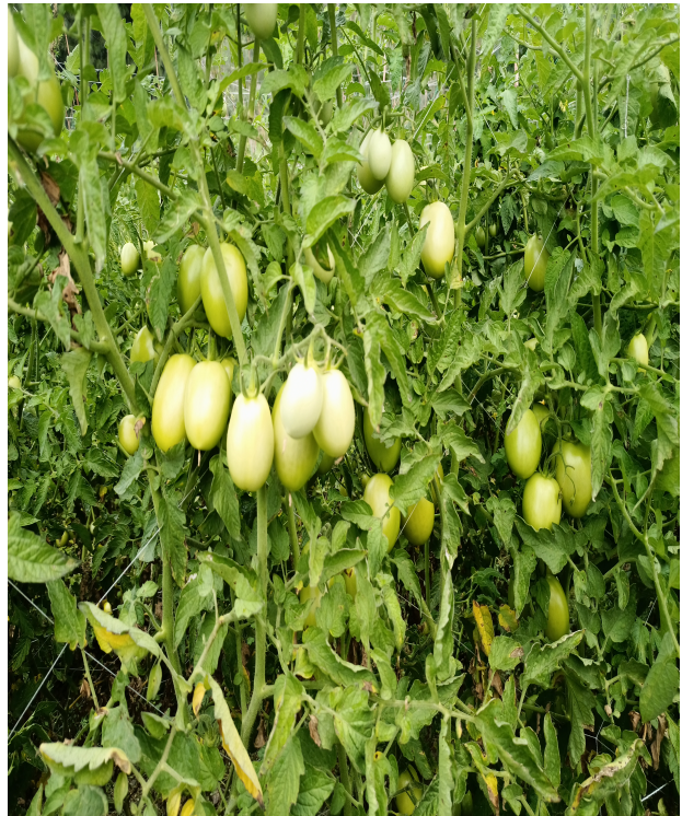
Vertical Tomato Farms of local farmers – cultivated with the help of ABKT