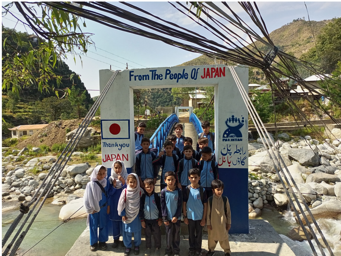
ABKT constructed a suspension bridge in village Batal, Upper Dir