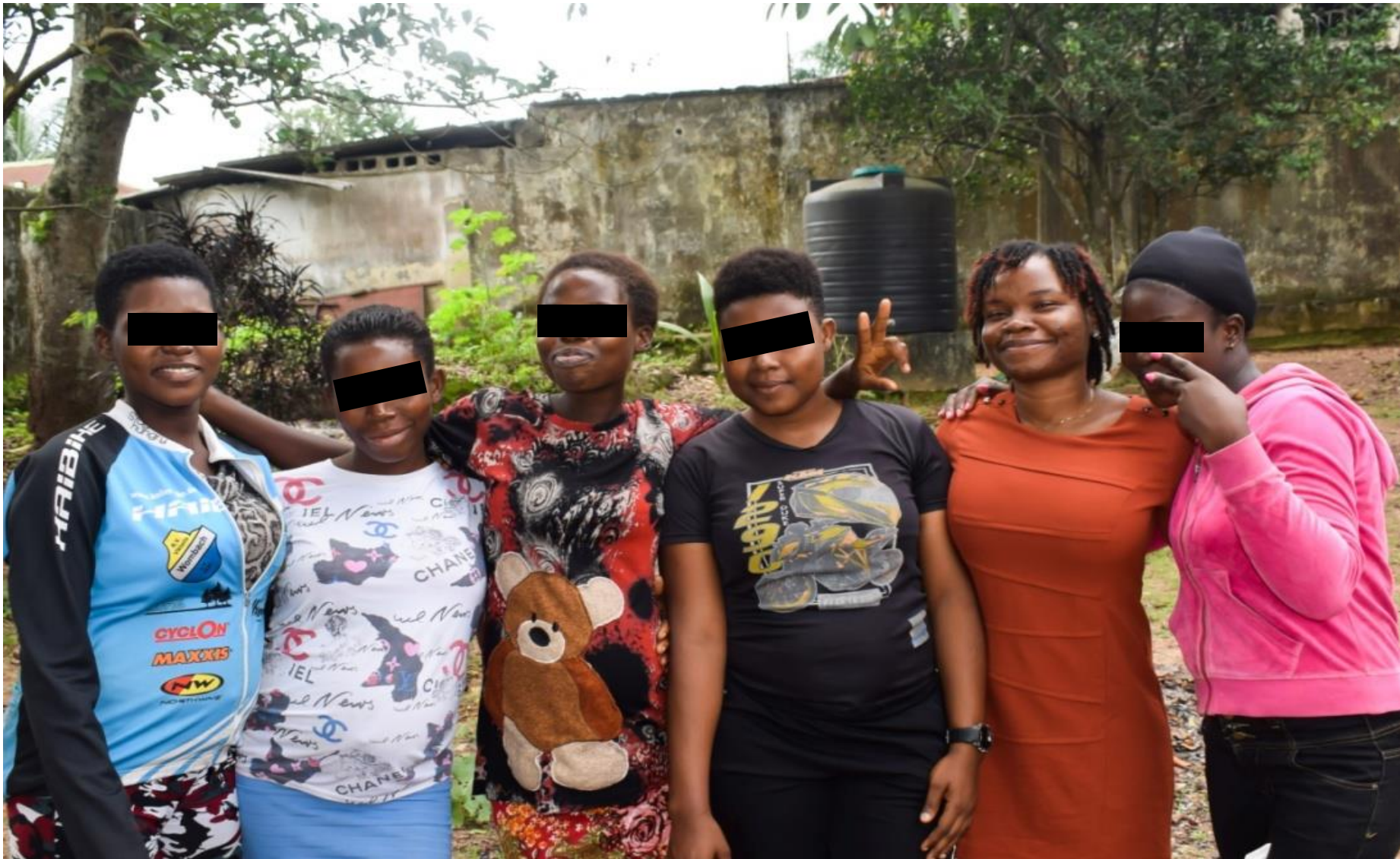
AAAF with the pregnant and parenting teenagers