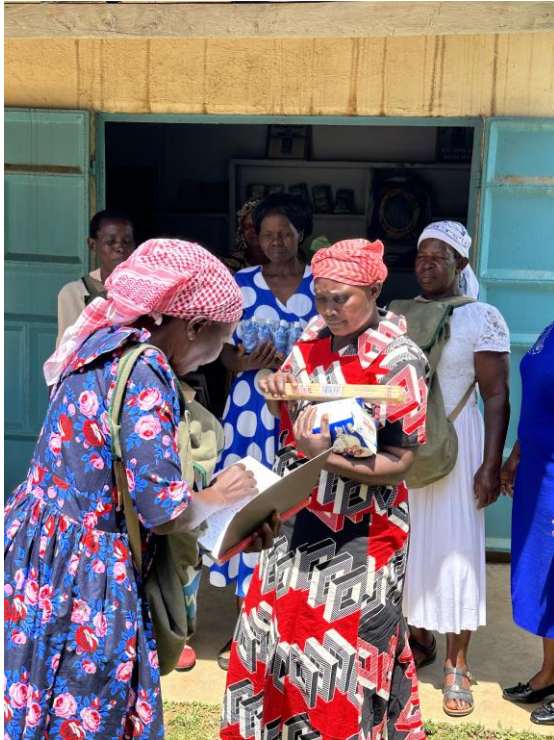
Community Health Volunteers with health products