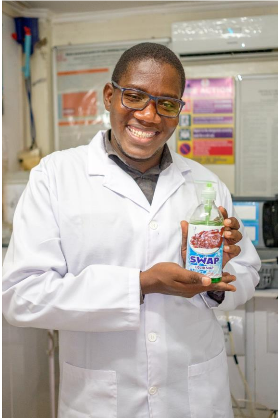
Final product of liquid soap