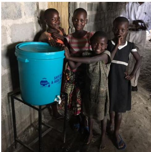
Children displaced at the handwashing station

SWAP is member of the Western Humanitarian Hub. The region has frequently experienced flood following erratic rains and climate change. Mostly families living along the lake are occasionally evacuated after their homes are submerged by water. Some lost their shelter, crops and source of income. SWAP is among the first responders visiting affected families and donating food and non-food items. Handwashing stations and liquid soap are distributed and strategically placed at evacuation camps. Local disaster committees and community health volunteers are trained on social behavioral change communication and hand hygiene. These interventions have assisted to prevent disease outbreaks.