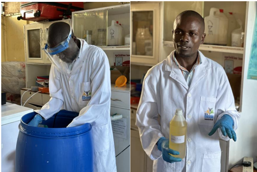
Production of Liquid Soap

Liquid soap is on high demand in the communities we serve. SWAP received Kenya Bureau of Standard approval for the production and distribution for a period of two years. Internal and external control is done by submitting samples for quality control and subjecting it to several tests to meet the desired standards. Production is ongoing, after which labeling is done and it is taken to the central store for safe storage ready for distribution. In the last quarter 400 liters of Liquid Soap was produced. The final product is packed in 5 liters and 150 ml and labeled ready for distribution