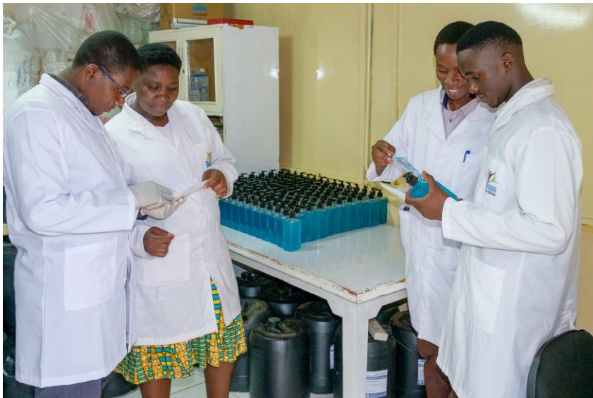
Lab team packaging and labeling the liquid soap