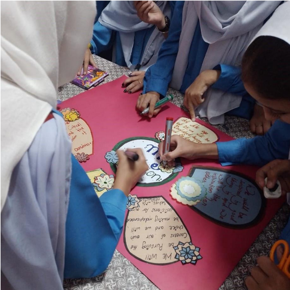
Anisa's students penning down their visions!

Grounded in purpose: Students articulate vision and goals