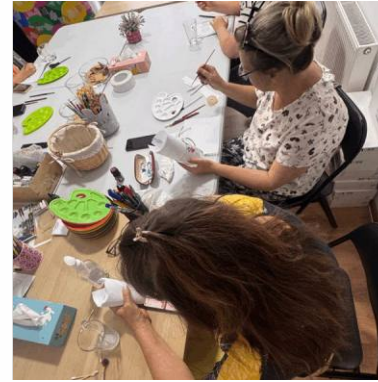
Glass painting workshops