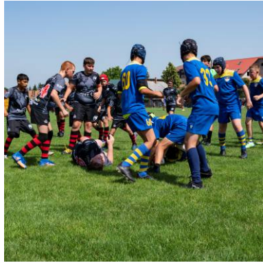
Sport summer festival