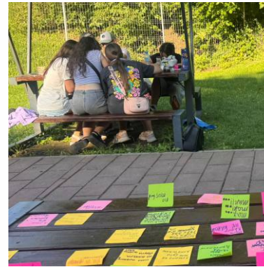
Painting workshops for teenagers