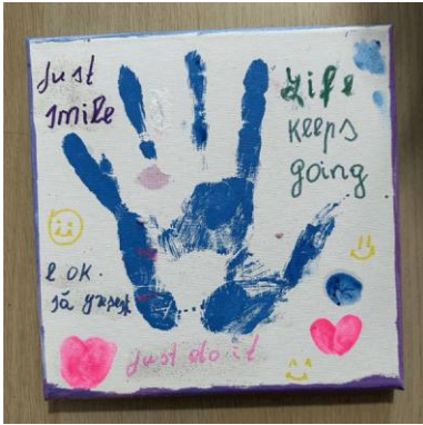
Painting workshops for teenagers