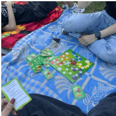
Painting workshops for teenagers