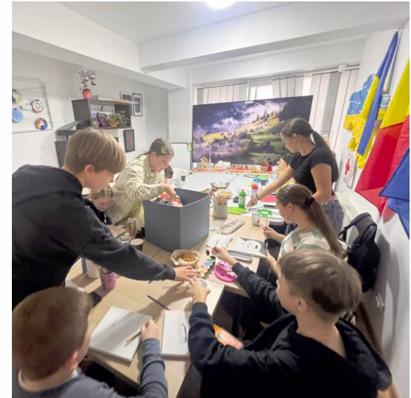
Painting workshops for teenagers