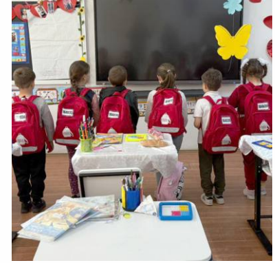
Back to school items