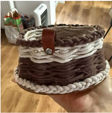
Basket crafting workshop