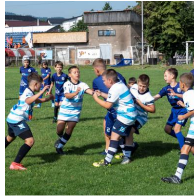
Sport summer festival