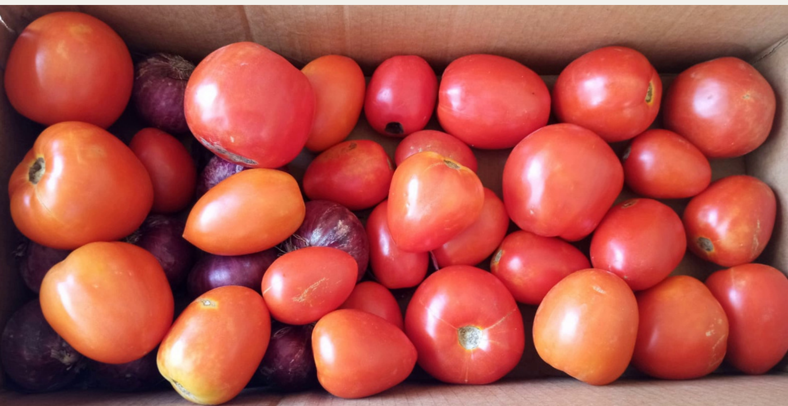
Upendo harvested tomatoes and kale from the kitchen garden which were prepared for the children's meals.