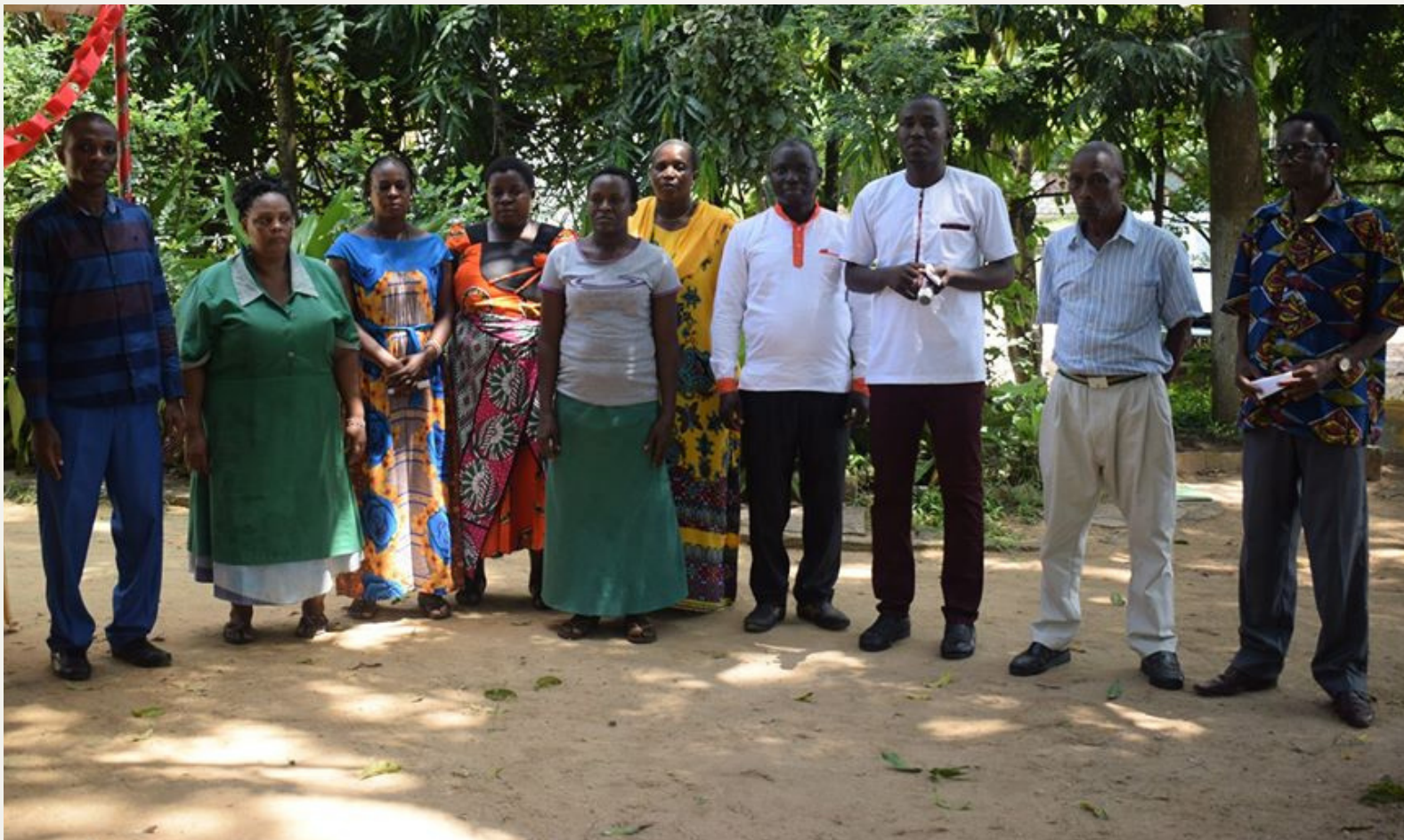
Upendo Children Kilifi staff with some of the school teachers.

Upendo is currently seeking funds to put up a perimeter wall around its premises to maximise security of its assets and all persons involved with the project.