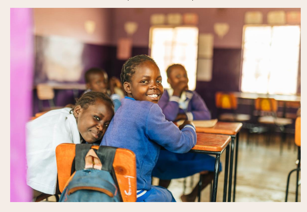
Supporting local schools Empowering the community with skills and jobs Supporting healthcare facilities and staff