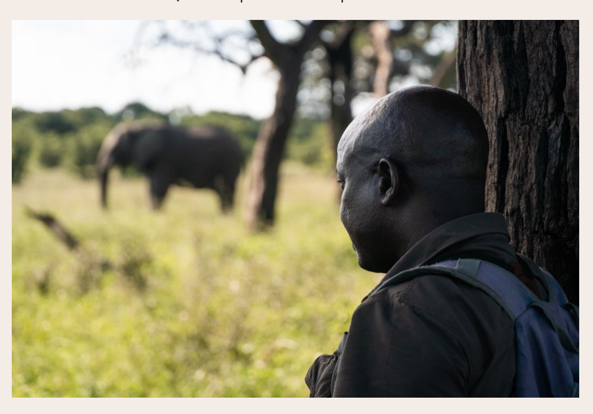
Human-wildlife co-existence Support conservation areas, and organisations Secure, enhance, and rewild new conservation areas, and corridors