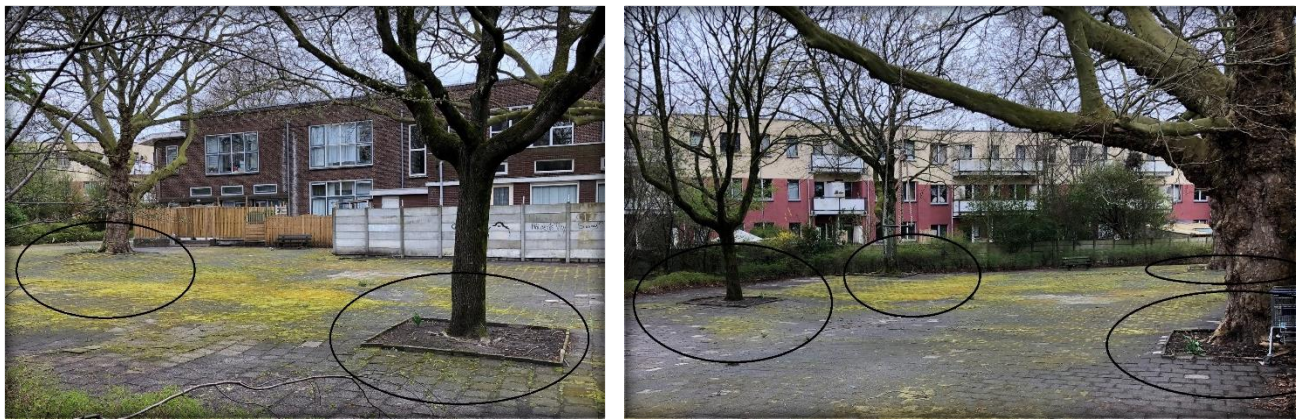
Vestia proposal for Social Gardening in Transvaal: seesaw tile and bedding plants on the neighbourhood square!

We want to apply these three initiatives in a number of deprived areas in The Hague. We are currently considering various options, including Oorden en Raden, Bouwlust, Vrederust, Morgenstond, Spoorwijk, Transvaal and Mariahoeve. The latter neighbourhood is on our list because our partner Vestia has indicated that help is needed there and they would like to help in strengthening the neighbourhood cohesion. In the preparatory phase of this program we will weigh up the options and consult with our local partners and local residents. We also keep a close eye on the current situation in the neighbourhoods in order to be able to offer help where it is really needed.