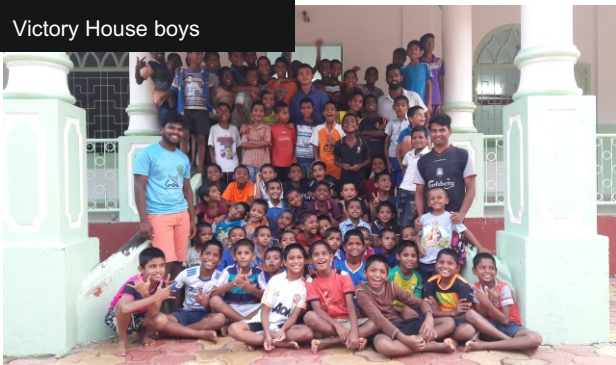
Victory House boys

During this period El Shaddai has been extensively working to reach out to the poorest of the poor with the distribution of meals, dry ration kits, sanitisers, masks, pads, stationery, tarpaulin sheets, COVID aid kits to the poor, marginalized and affected.