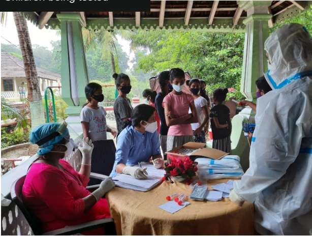
Children being tested

Most of our children have come back. On August, 15 of our children were affected with COVID 19, RT - PCR test was done by PHC, Siolim. The children were isolated for a term period of 14 days. Now all the children are recovered. As per the suggestions of the doctor's children were given required diets to build their immunity and all precautionary measures are followed.