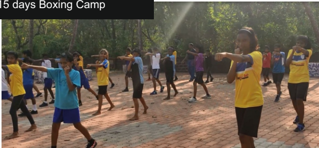
15 days Boxing Camp