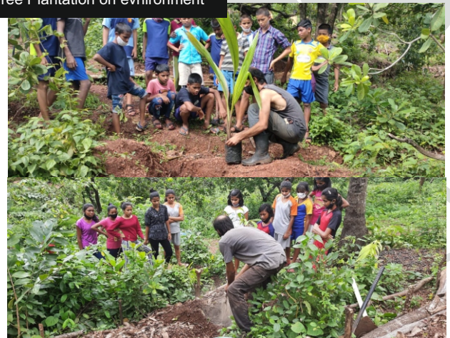
Tree Plantation on environment

Children participated in the tree plantation ceremony organized in the Norma House with the aim to educate the children to care for the environment by making a deliberate effort to be part of the change. Stressing to “Go Green” means to pursue knowledge and practices that can lead to more environmentally friendly and ecologically responsible, which can help protect the environment.