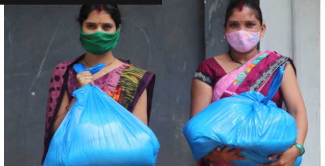
Dry Ration distribution drive

El Shaddai has ensured daily sustenance for the children and people, making sure no one has to sleep on an empty stomach.