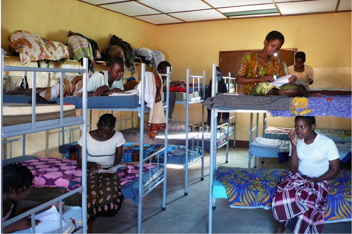
[Female dorm room – picture before the COVID-19 pandemic]