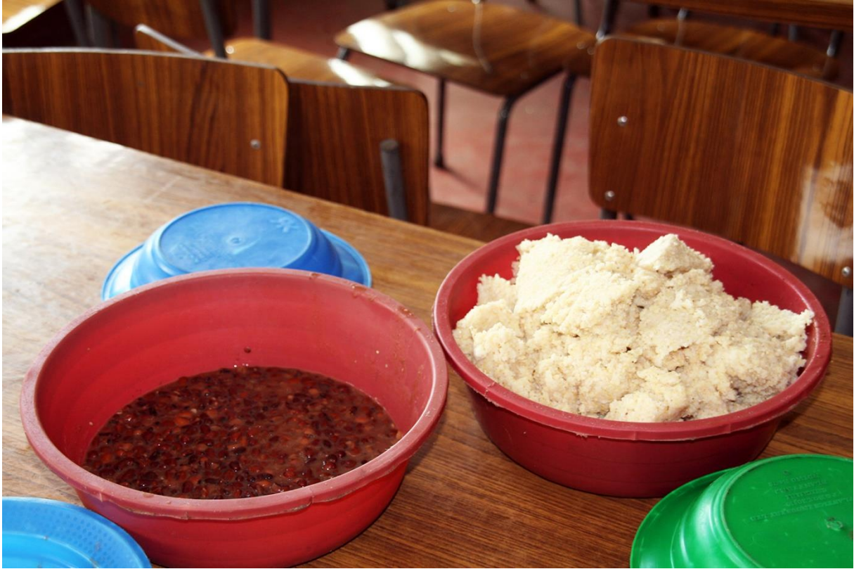
[Stew of beans and chima – made with corn flour, the staple of the diet in Mozambique]