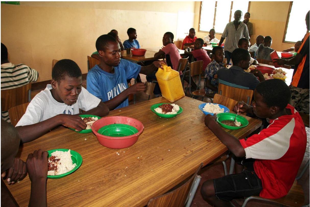
[Boarding students having lunch with the food provided by ESMABAMA]