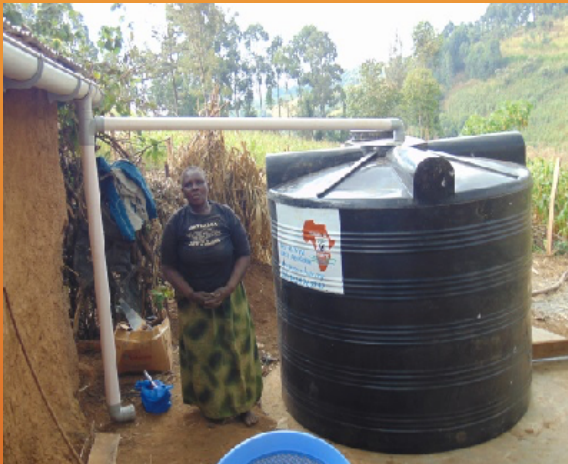
Water tank at a home