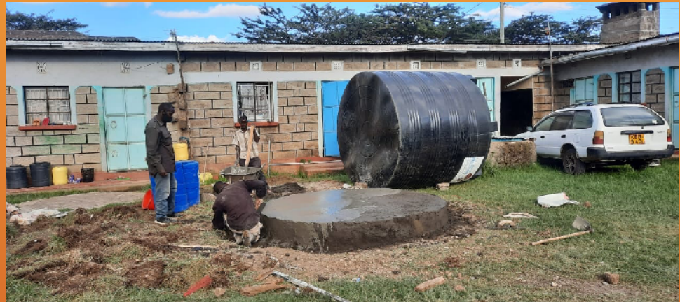
Tank foundation being built for a compound