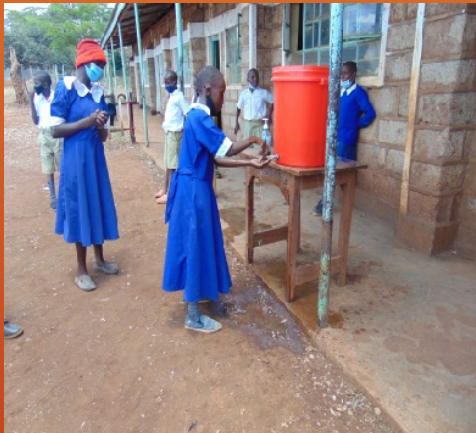
School children at a hand washing station