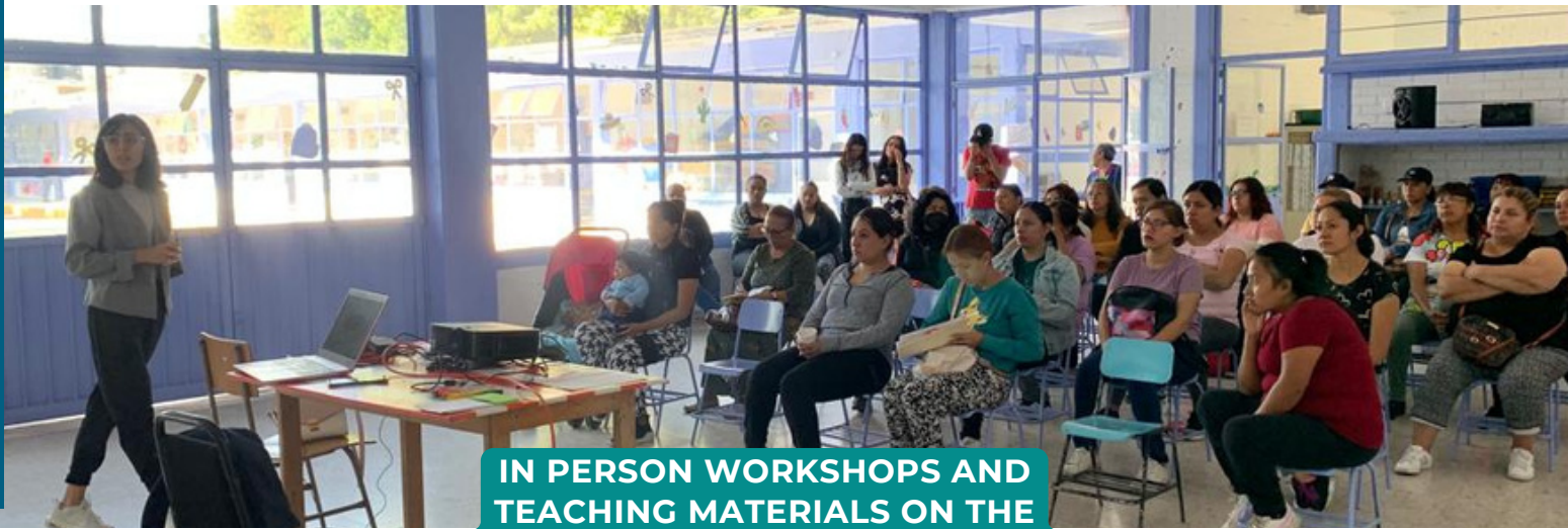
IN PERSON WORKSHOPS AND TEACHING MATERIALS ON THE PREVENTION OF CHILD SEXUAL ABUSE

We continued our community communication campaign to prevent sexual abuse in Malinalco. We created a mural in the primary and secondary corridor of the municipal seat. We printed 250 posters, which we are installing in various parts of the municipality. The network of spokespersons was reactivated, a project that seeks to train women who are leaders in their community to be able to talk about Child Sexual Abuse. So far, five sessions have been held with the spokespersons.