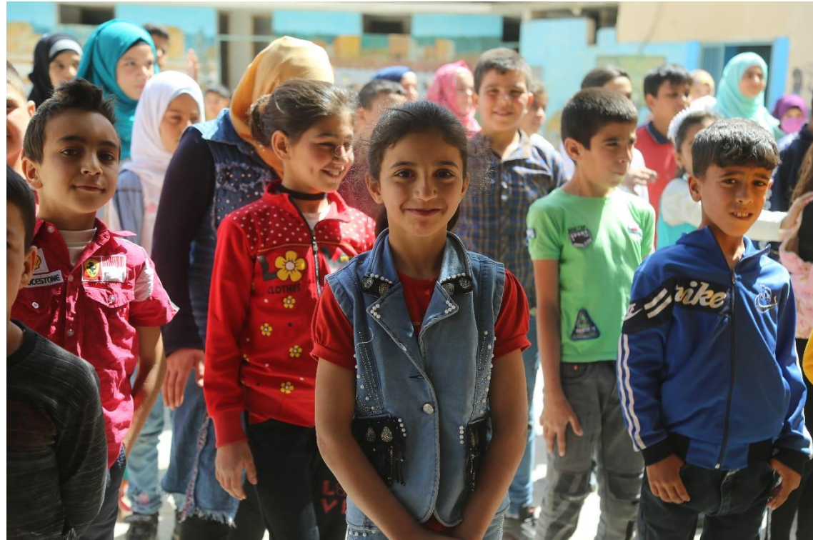
Their smile is worth sustaining!

Many children in Lebanon have been out of school since October 2019, when protests and civil unrest affected many parts of the country. The same year saw multiple teachers' strikes over delayed salary payments, further disrupting learning. The learning crisis was further compounded by a currency collapse, and the Beirut port explosion and COVID-19 lockdown measures.