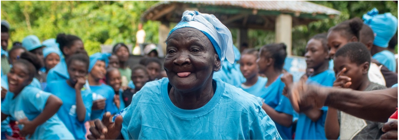
A sensitization campaign implemented by IOM Haiti to raise awareness on COVID-19 vaccinations and the risks of irregular migration and human trafficking.