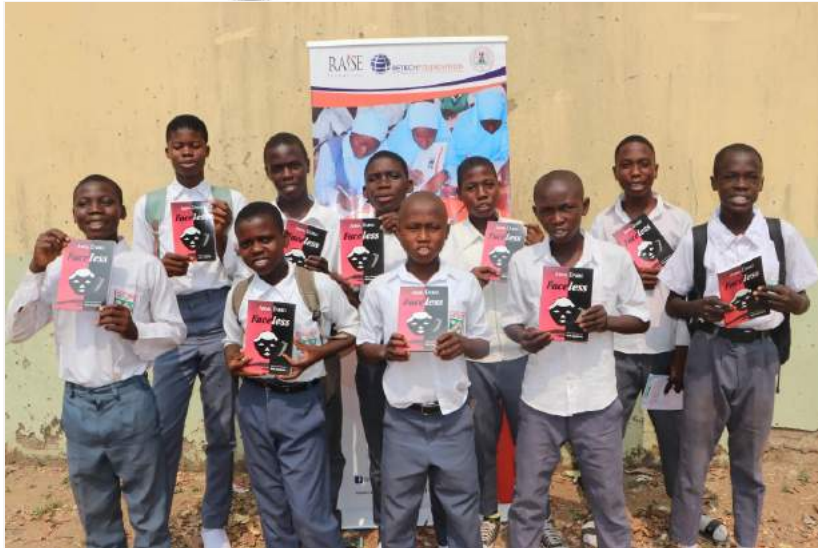
3. Zarumai Model Secondary School, Minna.