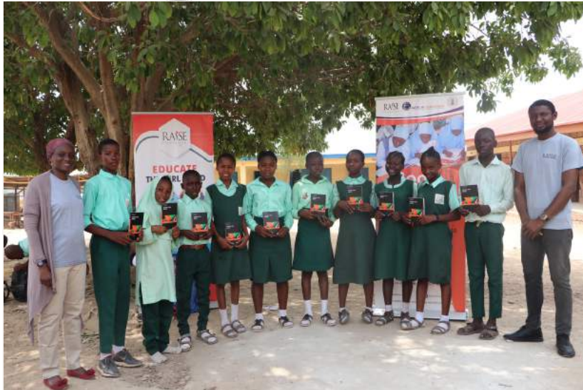
5. Federal Government College, Minna.