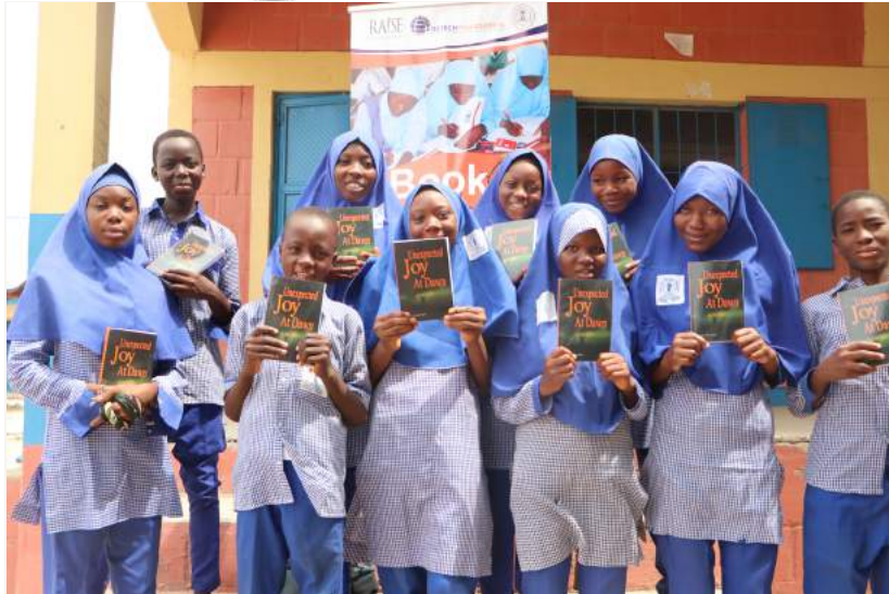
4. Army Day Secondary School, Minna.