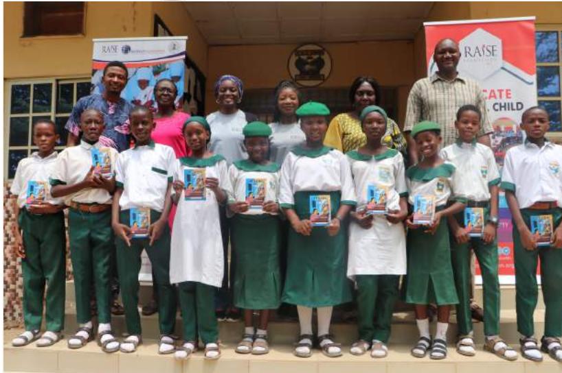
6. Hill Top Model Secondary School, Minna.