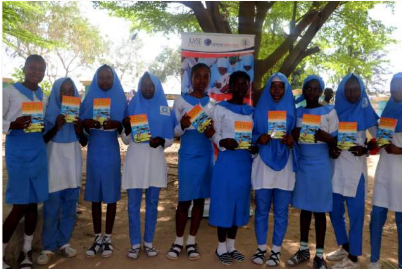
7. Government Girls Secondary School (GGSS), Minna.