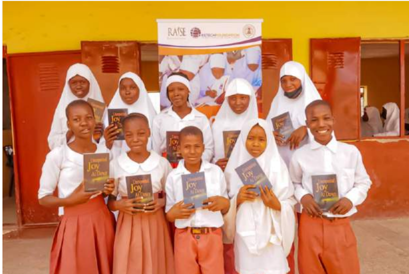
2. Father O'Connell Science College, Minna.