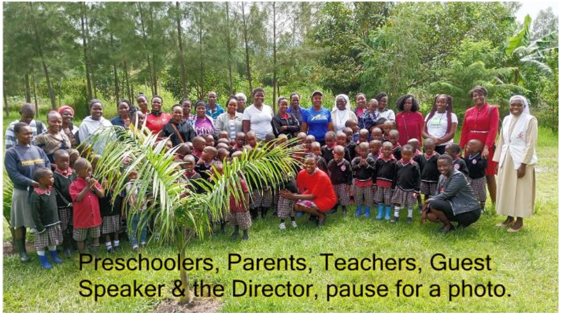
Preschoolers, Parents, Teachers, Guest Speaker & the Director, pause for a photo.