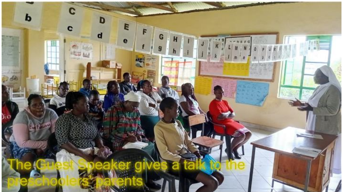
The Guest Speaker gives a talk to the preschoolers' parents