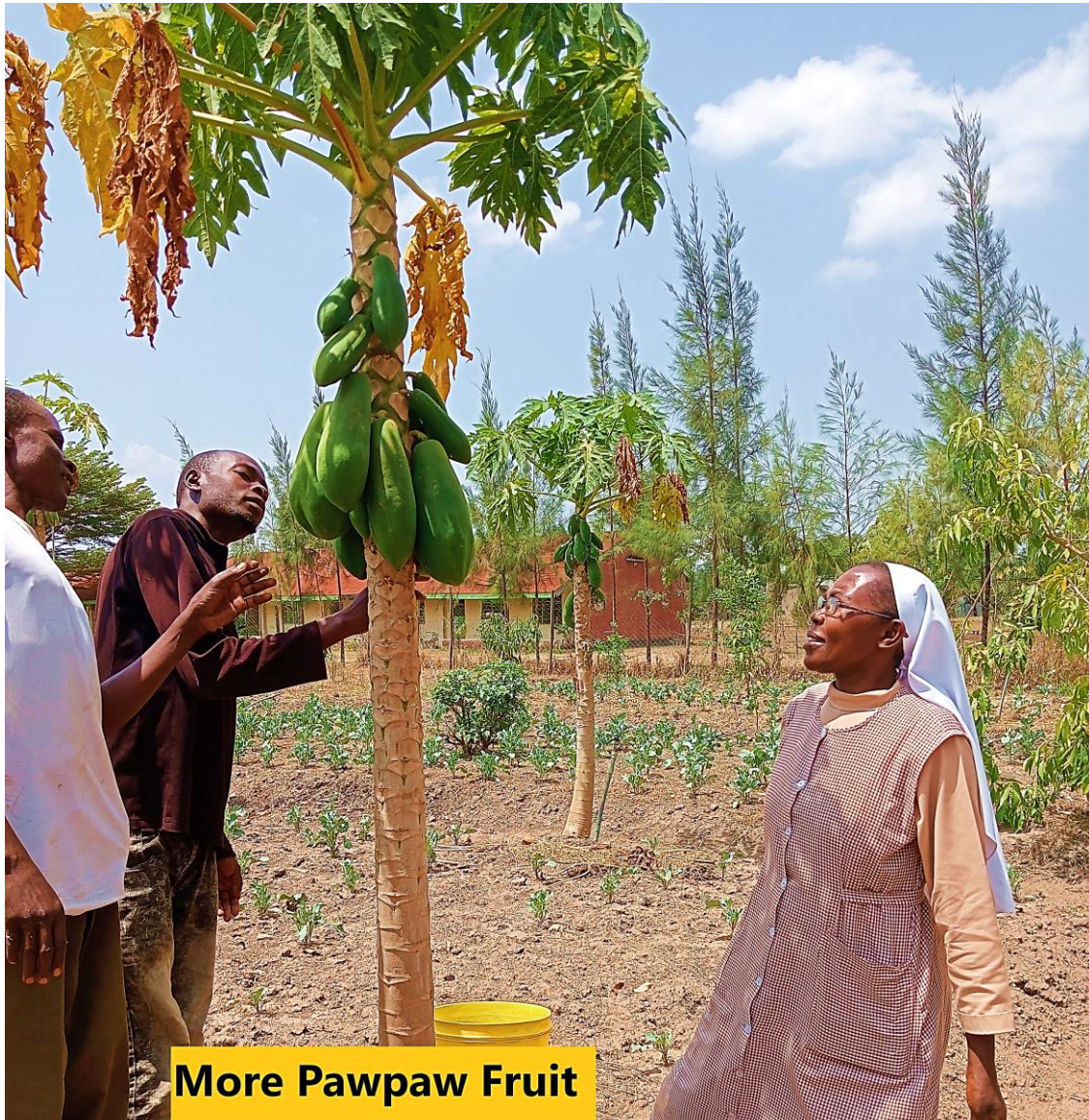
More Pawpaw Fruit