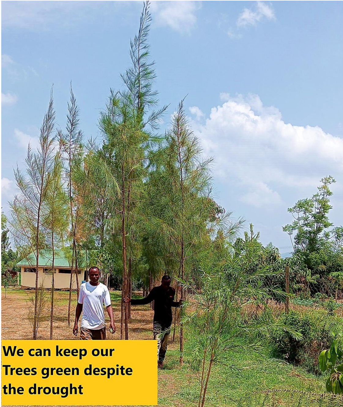
Figure 6 We are grateful to our borehole water, at least we can still keep our trees alive