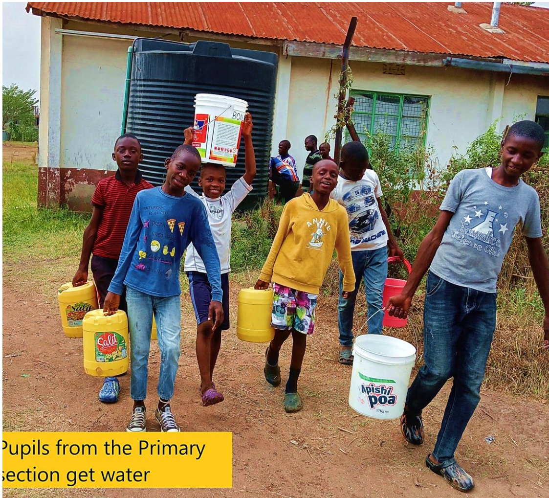
Pupils from the Primary section get water