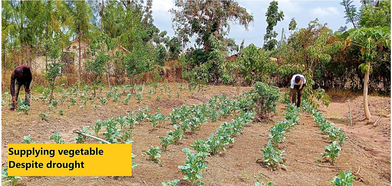
Figure 3: At least we've been able to feed from our garden