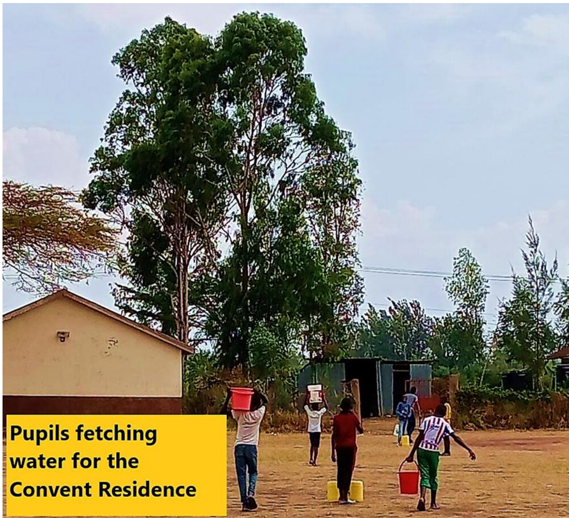
Figure 5: You can see how dry it is at the moment, now since January.