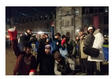
Boxing with the isolated minors front of the Council of State