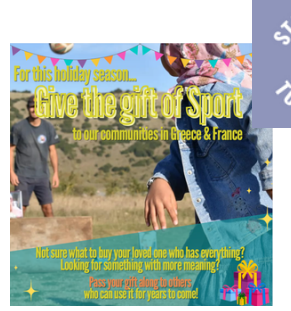
Give the Gift of Sport social media post

YSR was also one of 40 organisations supported by Leave No One Behind's #StrongerTogether Campaign. This is still ongoing and has been successful in raising funds.