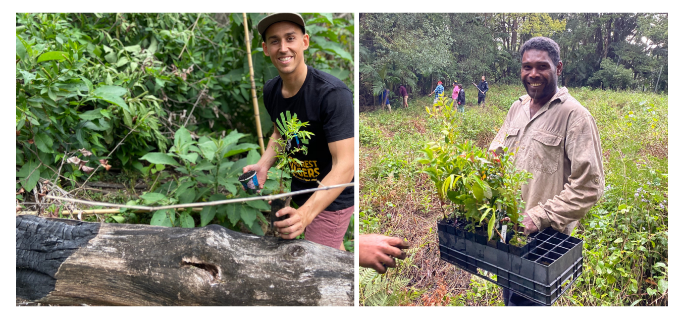
A volunteer (left) and staff (right) at a tree planting site in Wanganui.

The program is now one year in. Our incredible team has regenerated 10 hectares of fire affected land, establishing approximately 80,0000 trees and they have planted 12,000 mixed species trees including endangered and critically endangered plant species and those that provide food and habitat for local wildlife.