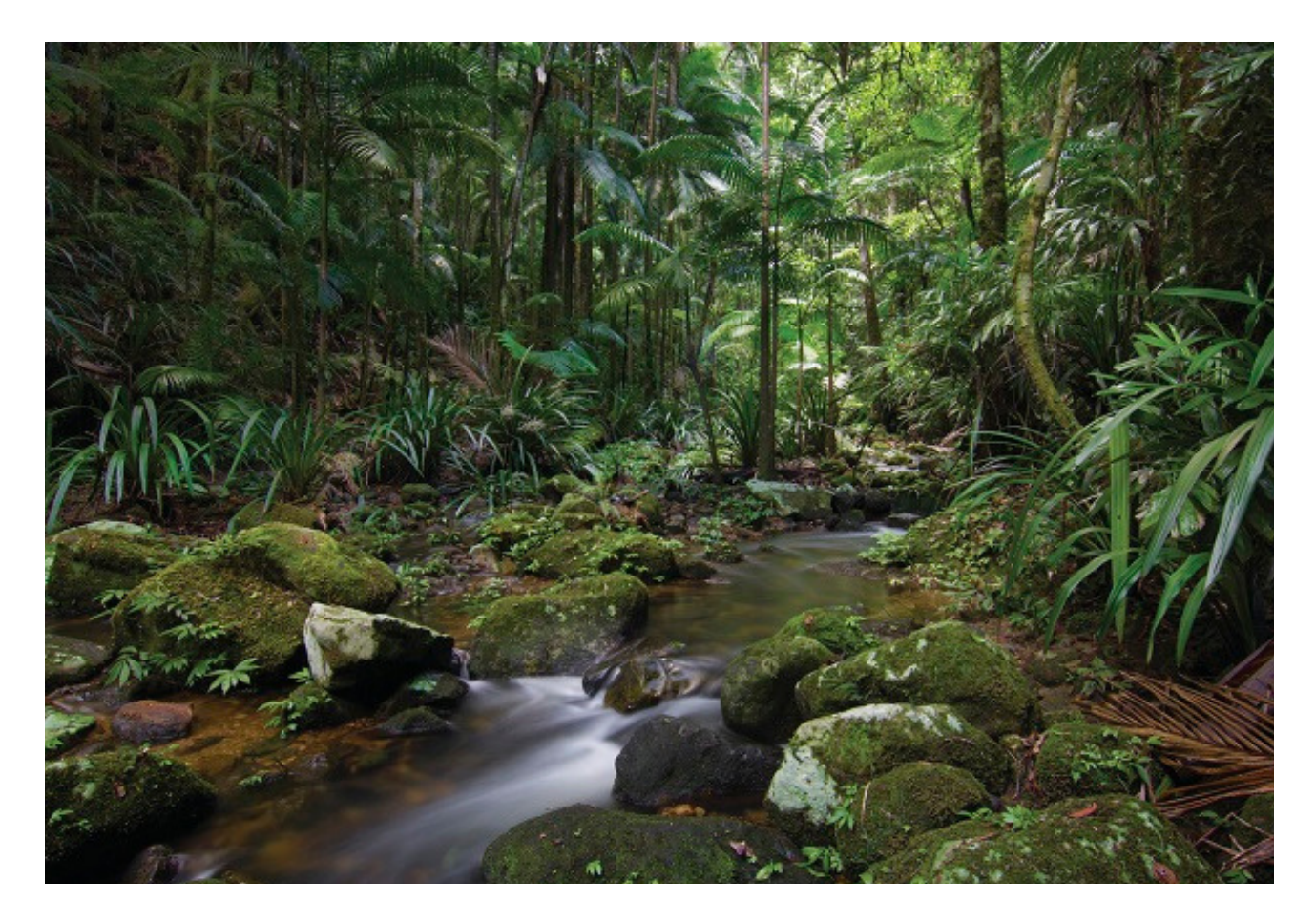
Inside Nightcap National Park, internationally recognised biodiversity hotspot and ecologically significant due to outstanding examples of major stages in the Earth's evolutionary history.

Ecosystems of the wider Gondwana Rainforests contain significant and important natural habitats for species of conservation significance, particularly those associated with the rainforests. The wider Gondwana Rainforests protects the largest and best stands of rainforest habitat remaining in this region.