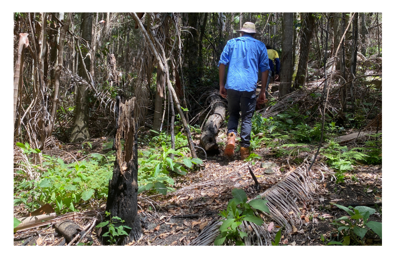
Burnt debris remains throughout the area. All living plants seen in this image are weeds that are quickly growing amongst the debris. These weeds were soon waist height and spreading rapidly through this site.

If no action is taken, the thousands of hectares of burnt subtropical rainforest will become a breeding ground for invasive weed species. This will reduce the strength and biodiversity in an already vulnerable forest ecosystem.