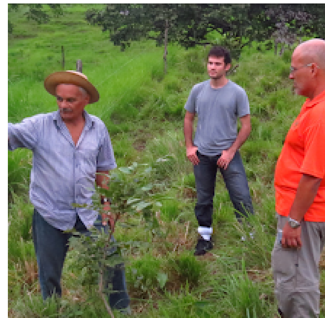
A producer from past years participates actively in planning the reforested parcel, explaining the characteristics of his farm to the Azuero Earth Project team.

10. Monitoring ( 2+ times per year in 2020, 2021, 2022 ): The Azuero Eco Foundation will come monitor the planting and health/survival of the trees. Staff will also speak with the producers about relevant information