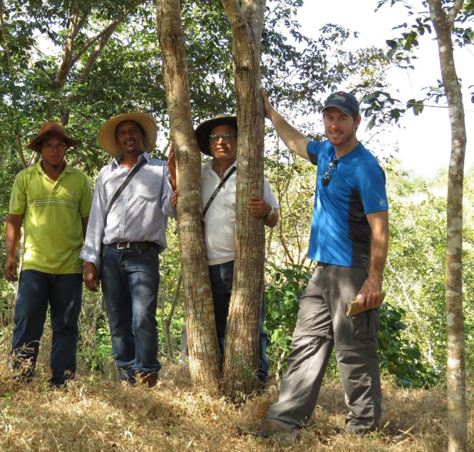
Program staff from past years in the field for a data collection trip.A

3. Second meeting--Species selection ( April-May ): The producer chooses his/her species based on the land parcel's characteristics and our recommendations.