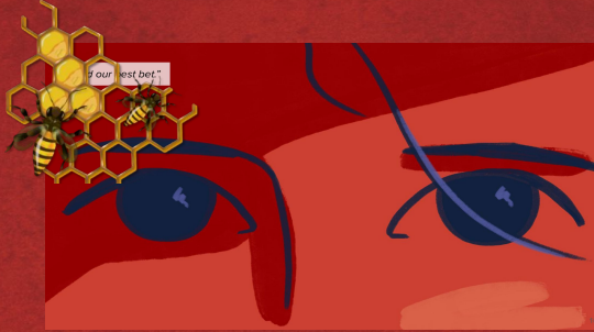
Digital Story Hive