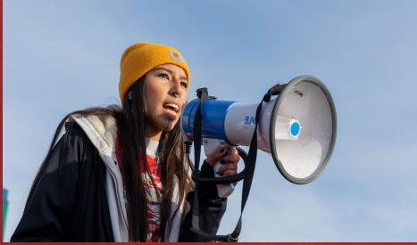
Future Rising Fellowship