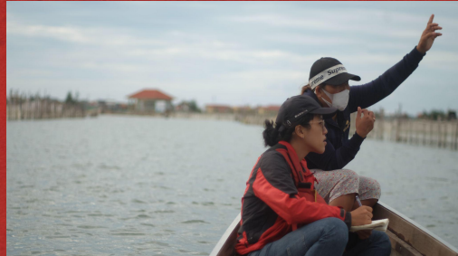
Social Action Campaign