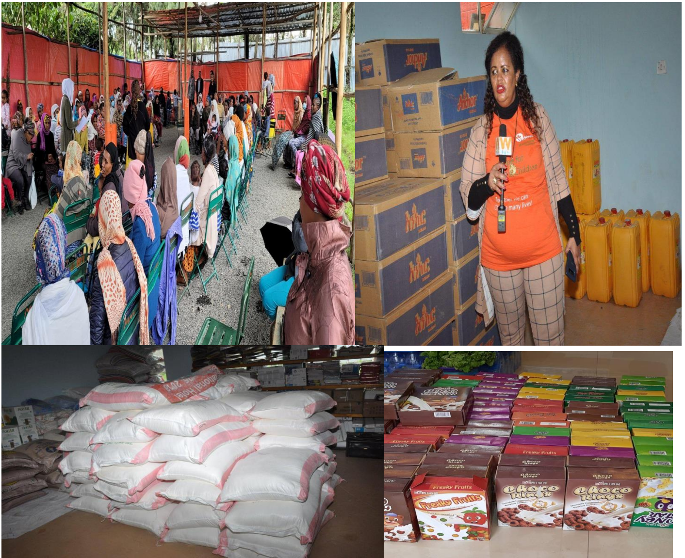
Food and nutritious made ready for distribution to IDP peoples with support of Global giving , special individuals and foundations

Alongside MHO also on the farm and promoting alternative food production address immediate needs in the aftermath of displacement and specifically their food, nutrition and feed our affected community and including current children and poor women beneficiaries sheltered in our different MHO rehabilitation centers in a sustainable way