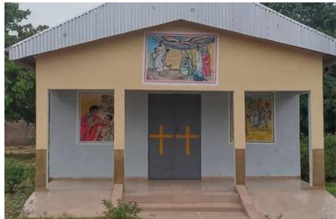
the new chapel of Bondoukou