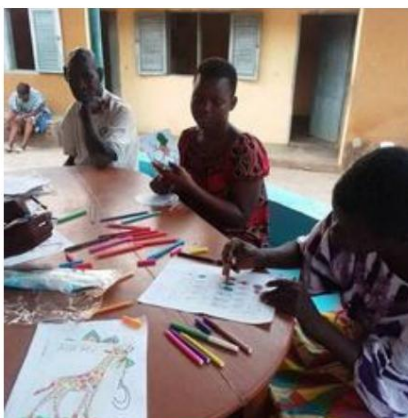
Activities of the apatam