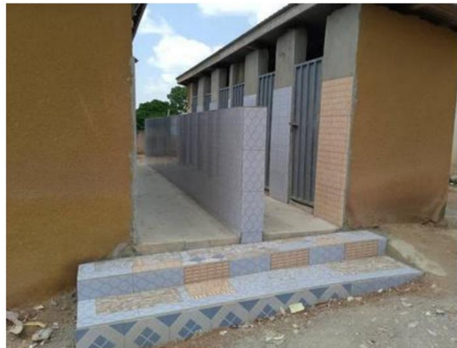
Renovation of the sanitary facilities