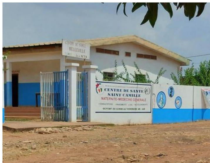
Belleville Dispensary 2