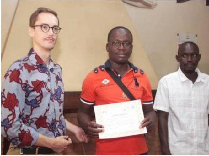
DAR ES SALAAM