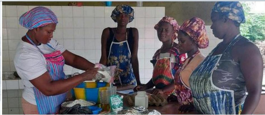
COLLECTIVE COOKING TRAINING SESSION