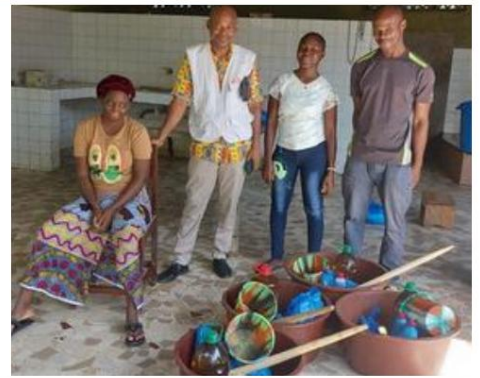
SOAP MAKING KITS