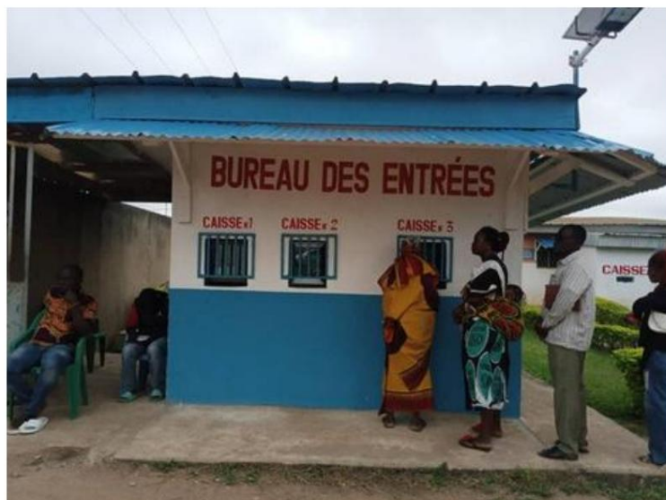
Renovation of the entrance office at Nimbo

We continue to communicate to better raise awareness of our healthcare offerings in Bouaké.