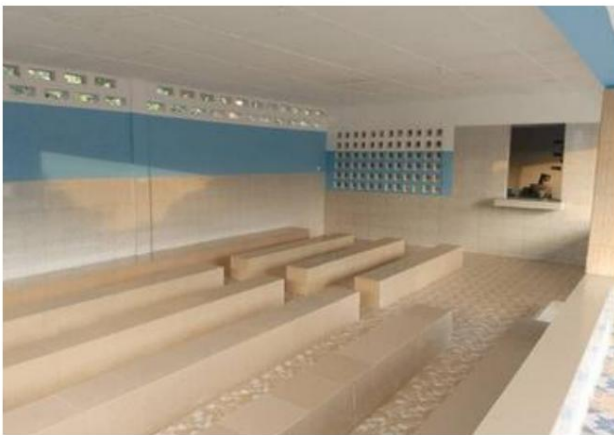
RENNOVATION OF THE INTERIOR OF THE CHAPEL