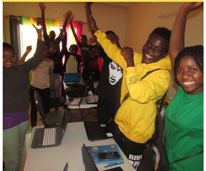
Our scholars excited as they kick off at the new center in Yaounde.