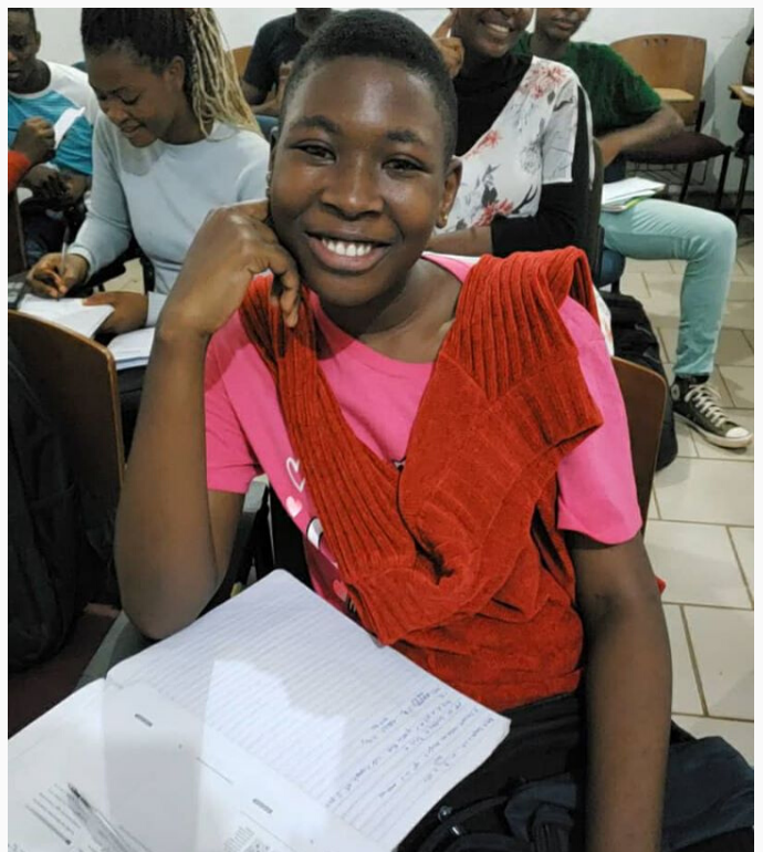
Our scholars taking their mock SAT test in preparation for the main SAT test coming up later in the year of 2019.