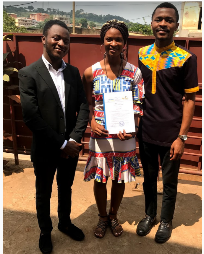
The end of the first summer academy in Yaounde marked a new beginning in the life of most of our scholars, who left more determined than ever before to impact their societies.

Edumail is a books & note-sharing organization that formed in response to the lack of formalized school curriculum being taught in the Northwest Region due to the ongoing crisis.