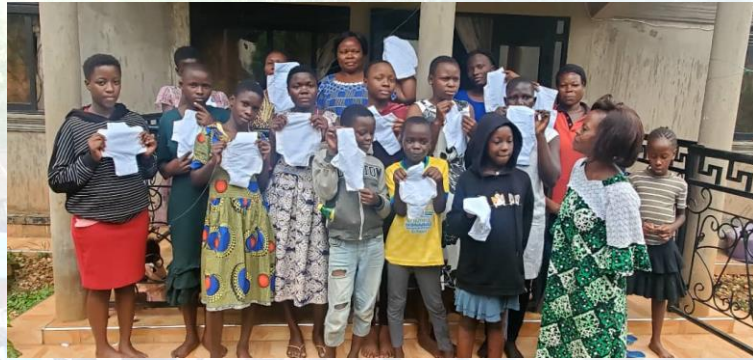
Participants display the reusable pads made during the two days training

Strategic Planning: We undertook to draw a strategic plan for the next three years, which is 2025-2027. We will be focusing on four major priority areas, that is;