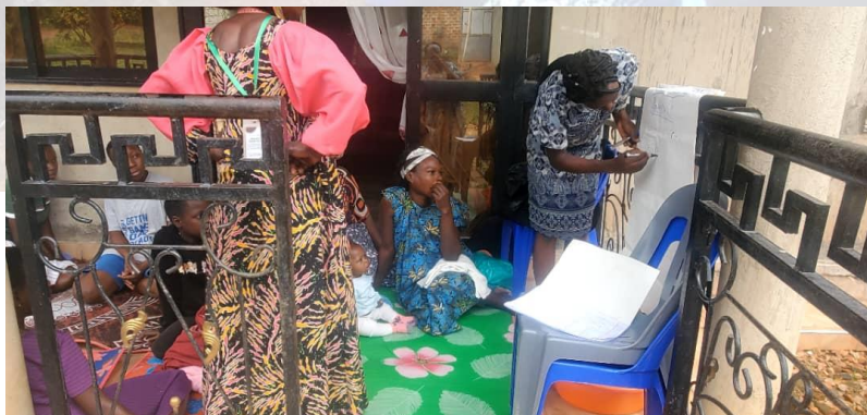
Some of the girls during the personal hygiene sessions.