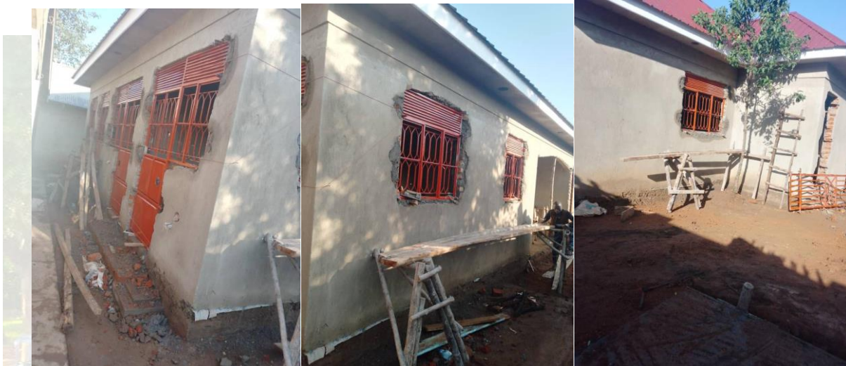
Renovation work on the building

This report covers a period of four months, April-July 2023. As reported previously, one of the founders allowed us to use her premises to set up a skills training centre. Ravens Foundation still has a limited financial base and so we depend heavily on the good will of our founders. Renovation of the building has stalled because we run out of funds.