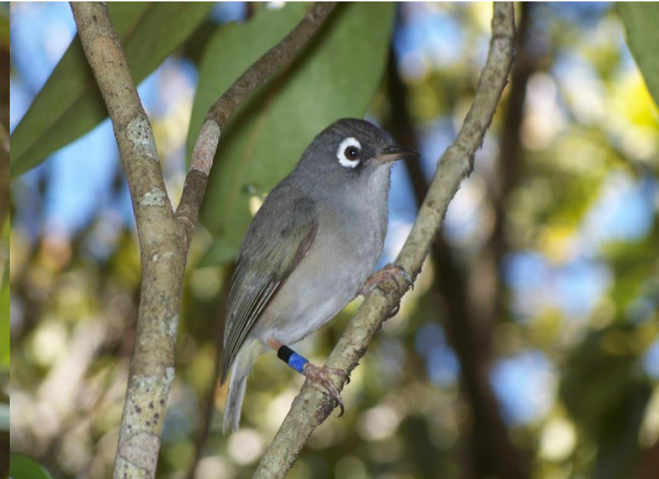
Re-introduction of Mauritius Olive White-eye