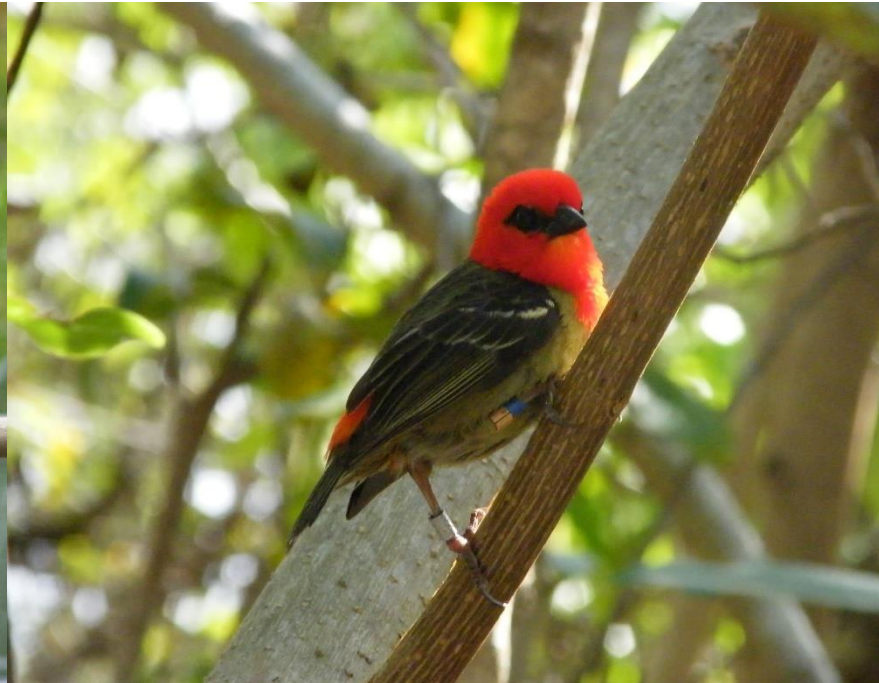
Re-introduction of Mauritius Fody