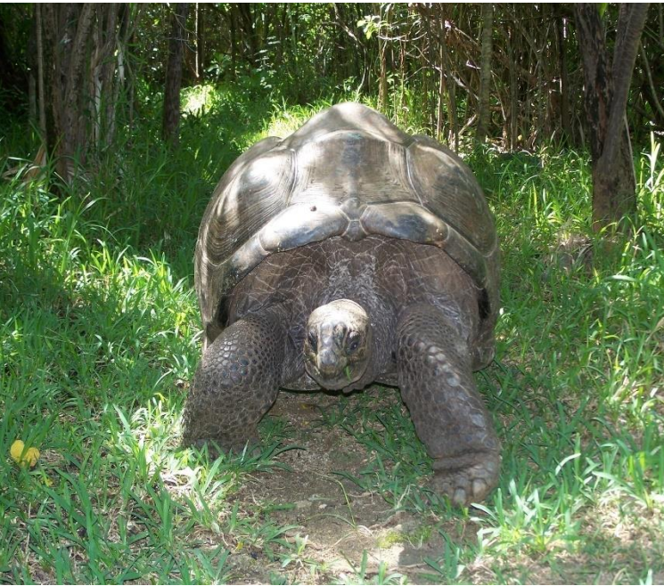
Aldabra giant tortoise