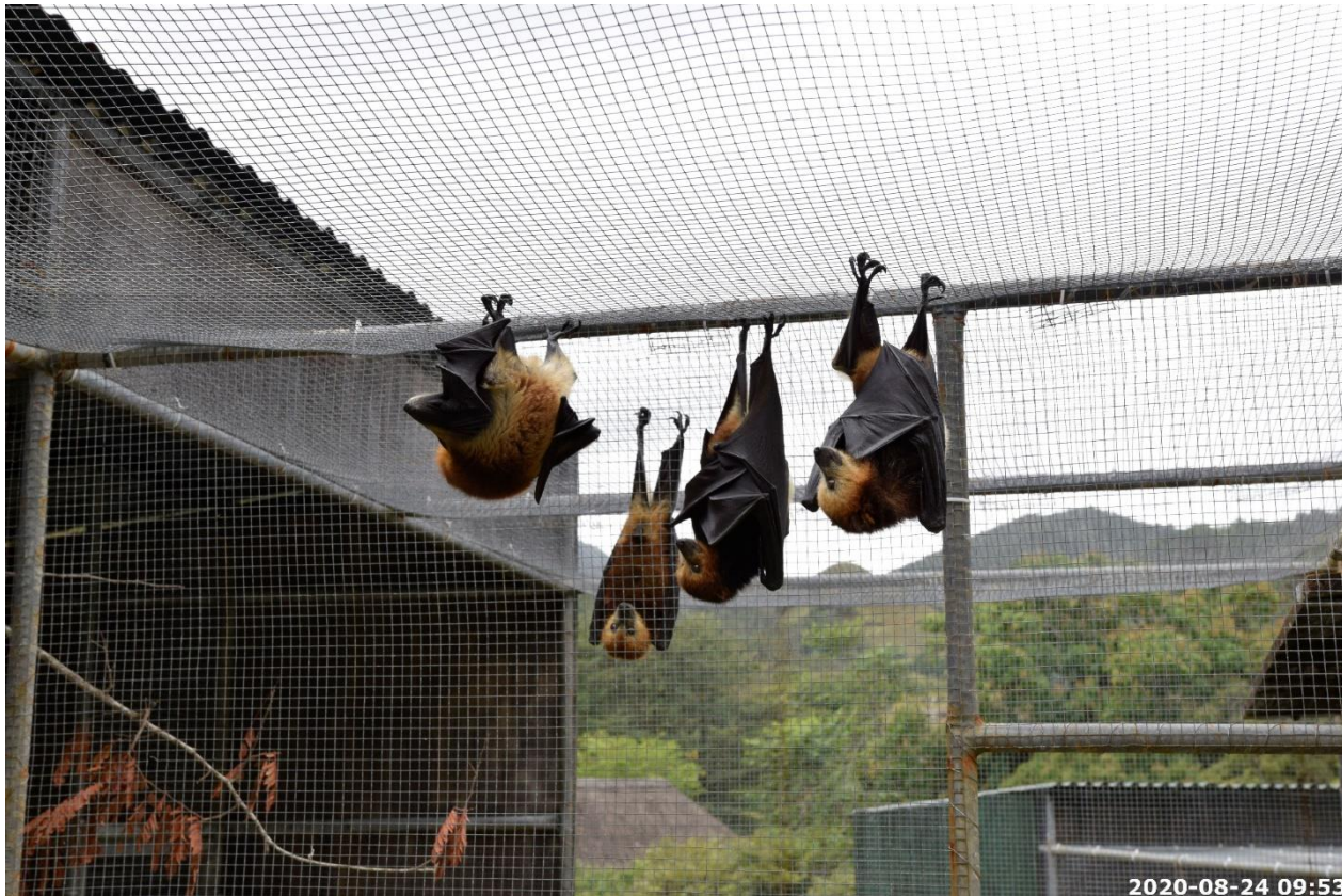
(Pteropus niger) , Endangered,