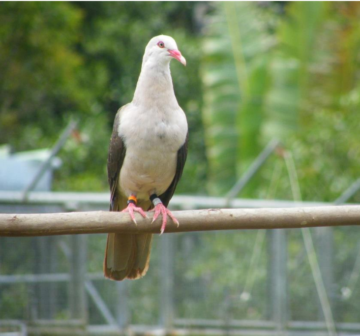
Reintroduction of Pink Pigeon