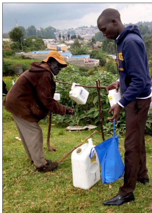
A Community Health Volunteer demonstrating handwashing with locally available resources during Laibon Field day, February 2020