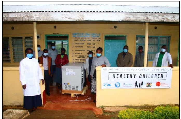
Distribution of vaccination fridge to Laliat Dispensary, July 2020

In 2020, 228 Outreach clinics were held in different locations across Kericho County bringing services to 11,600 people who attended.