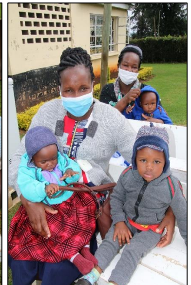
Mothers and babies at immunization clinic in Tea Research Institute Health Centre, July 2020