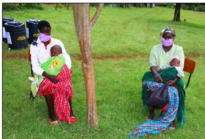
Mothers wait at Ndubusat Clinic to immunize their babies.

Many reasons contribute to poor maternal health including lack of knowledge, culture, fear, a lack of infrastructure, communities living long distances from health facilities, and lack of access to basic services such as clean water.