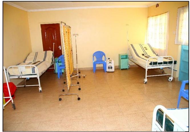
Isolation Ward, Londiani Sub County Hospital