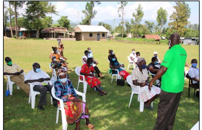
Training community volunteers on COVID-19 in Koru, May 2020