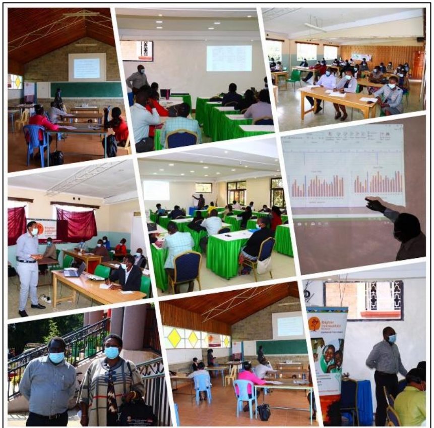
Health Care workers trainings in Kericho and Londiani in June of 2020

We worked with the Ministry of Health to strengthen the health services available across the county. A number of tasks were completed: