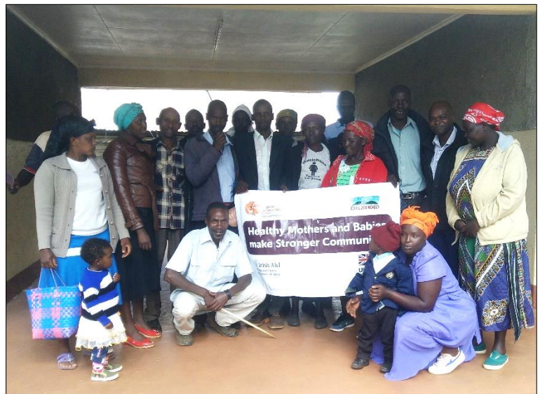
Community Maternal Task Force Volunteers maternal health training, Malageti