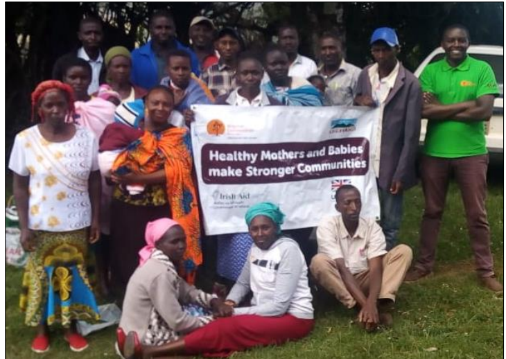
Tendeno CHVs undergoing Community Maternal Health Task Force training.

The trainings aim to equip participants to be able to deliver health messages to the community, identify maternal health issues early, recognise the danger signs and refer to health facilities for checkups and delivery. BCW works with the Ministry of Health in the delivery of these programs.