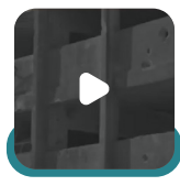
SCHOOLS IN SYRIA 2017

As information is a fundamental pillar in supporting decision-making, IMU sought to provide all information to both paths and above all, to the owners of the case, namely the Syrian people, Syrian civil society organizations active in the educational process. Information is periodically shared with the educational sector, reliefweb, Humanitarian Data Exchange, Humanitarian response and the Syrian educational platform