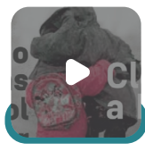
SCHOOLS IN SYRIA 2018