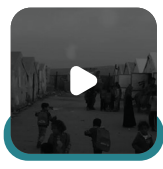
SCHOOLS IN CAMPS 2019