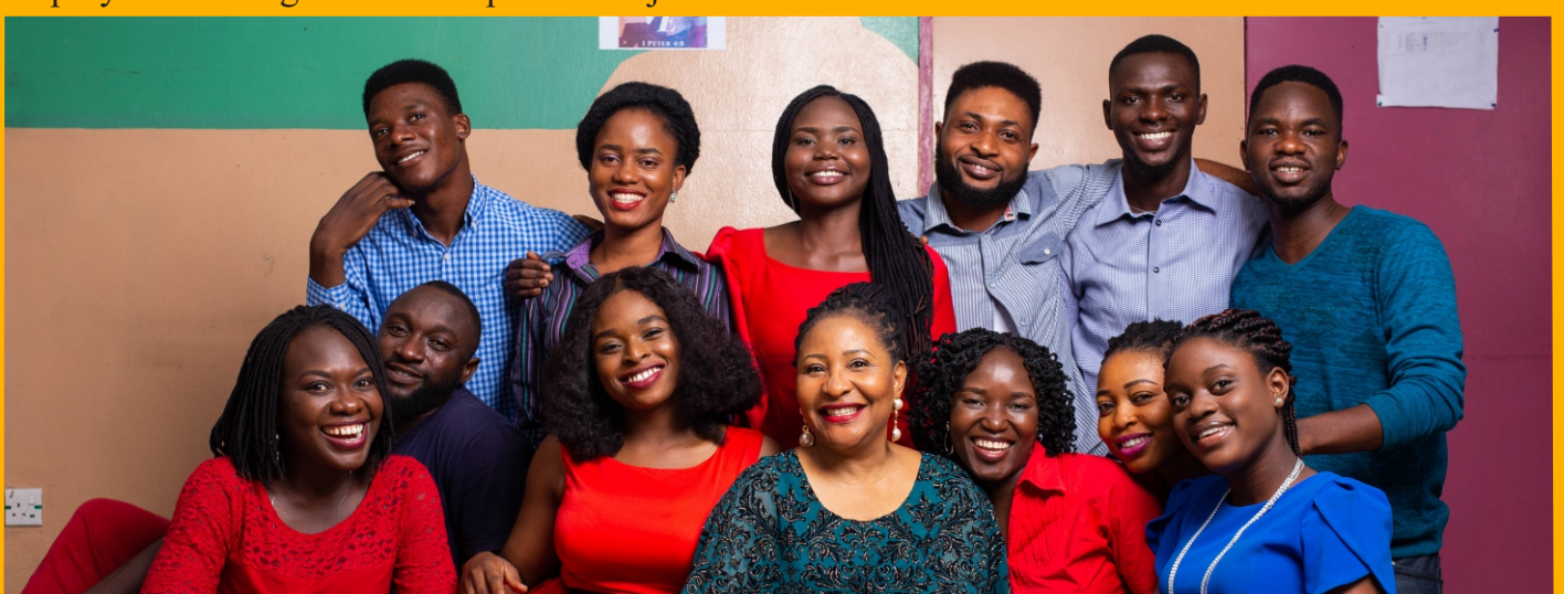
Tabitha Home Staff

The children are indirectly overseen by the Project Coordinator who works hand in hand with Home Administrator, Deputy Administrator and the Care Givers who attend to their person- centered care daily. The planning and implementation of the sustainability approach towards Tabitha Home is done by Administrative departments, this include the Coordinating, Monitoring&Evaluation, Accountability and Learning, Finance, Logistics and Procurement, Health &Safety and IT departments. The academics of the children are monitored and their performances enhanced by the employed coaching teachers in specific subject areas.