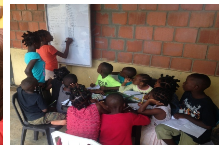
Tabitha Home Kid's Club