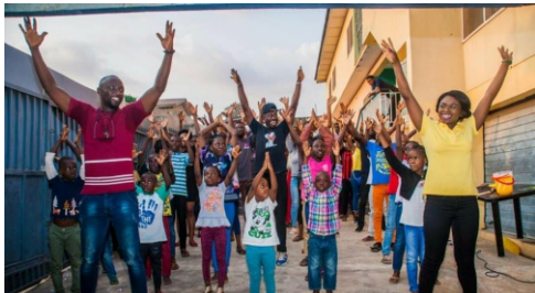
Aunty Lanre Initiative's Orphanage Tour at Tabitha Home