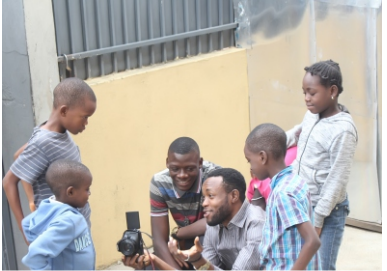
Photography session with a volunteer