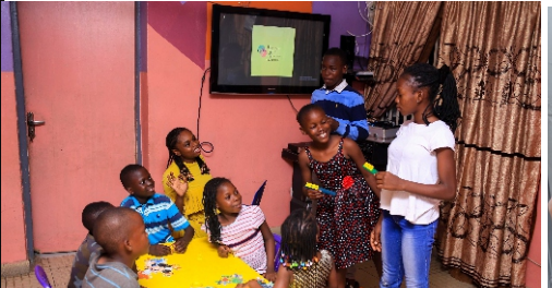
Tabitha Home French Club