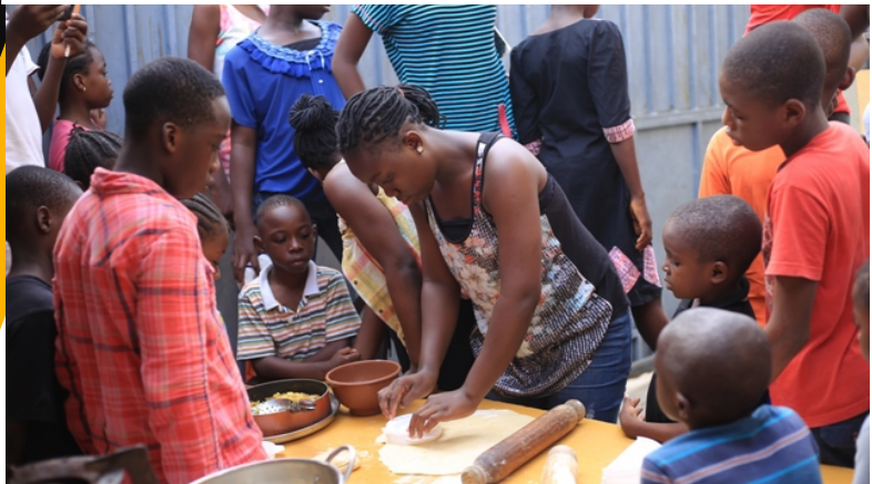
Tabitha Home Kids having a confectionary session