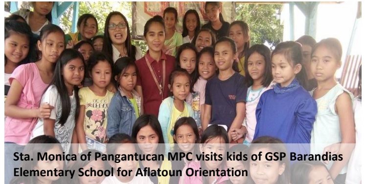
Sta. Monica of Pangantucan MPC visits kids of GSP Barandias Elementary School for Aflatoun Orientation