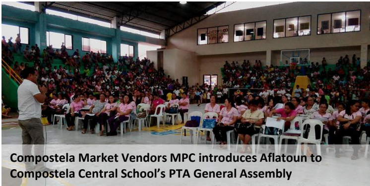
Compostela Market Vendors MPC introduces Aflatoun to Compostela Central School's PTA General Assembly

NATCCO's Aflatoun & Youth Network concludes the month of September with colorful celebrations inspired by social involvement and financial literacy. Here's what we've been up to for the whole month: