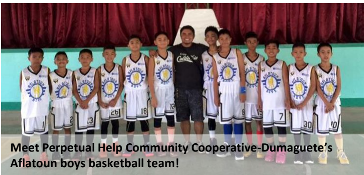
Meet Perpetual Help Community Cooperative-Dumaguete's Aflatoun boys basketball team!