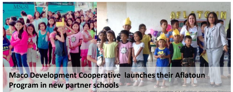
Maco Development Cooperative launches their Aflatoun Program in new partner schools