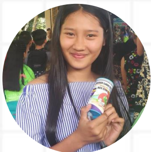
BCS Credit Cooperative Bansalan, July 27, 2018

The Aflatoun Program was successfully launched in the towns of Agoo and Pugo in La Union! With strong support coming from the DepEd Division of La Union and the Roman Catholic Diocese of San Fernando de La Union (DSFLU), we officially introduced our favorite fireball to the school children of Agoo Montessori Learning Center, Sanjubar Elementary School, and Paco Catholic School!