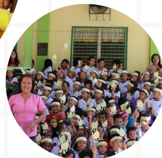
Perpetual Help Community Cooperative Cebu City

Guadalupe, Bolinawan, and Upland Elementary Schools welcomed Aflatoun with excitement and a firm determination to save! Our gratitude to the parents, teachers, school heads, and officials of the DepEd City Divisions of Carcar and Cebu for the unwavering support!